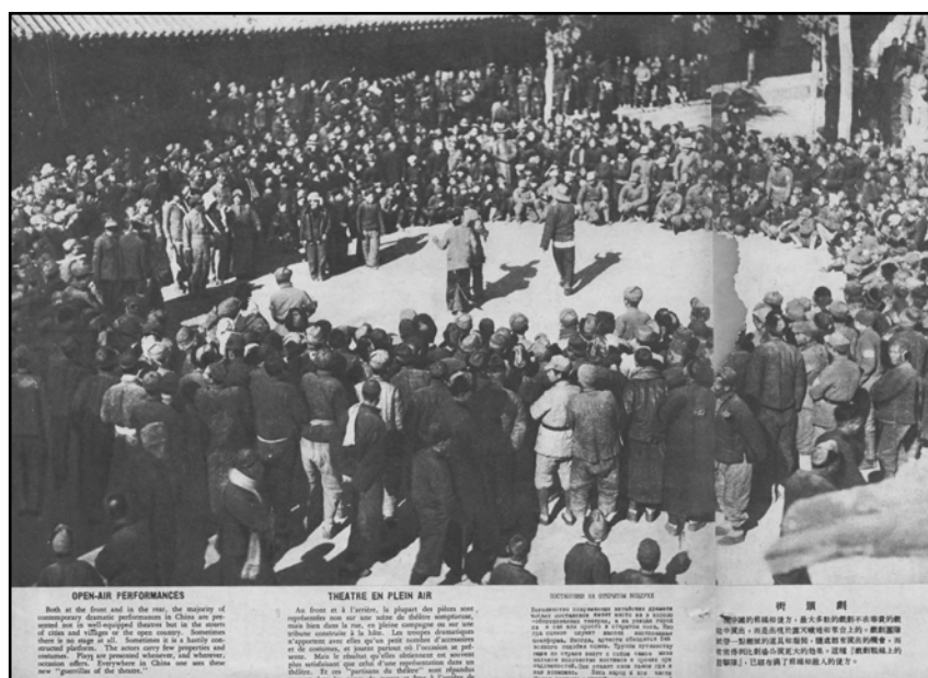
Figure 1. This publication describes “street theater” in four languages. Source: Jinri Zhongguo (China today) 1 (3): 23 (Hong Kong, September 1939). Image courtesy of the Shanghai Library.

urban centers, took their creations to villages and small towns across the country, bringing a new theatrical experience to as well as rousing patriotic sentiments among rural and culturally distant communities. In the process, the most successful street theater opened up an interactive space in which a national public could be called forth and a collective identity openly pledged. Theater itself was profoundly transformed as well and contributed to an emerging political culture (figure 1).