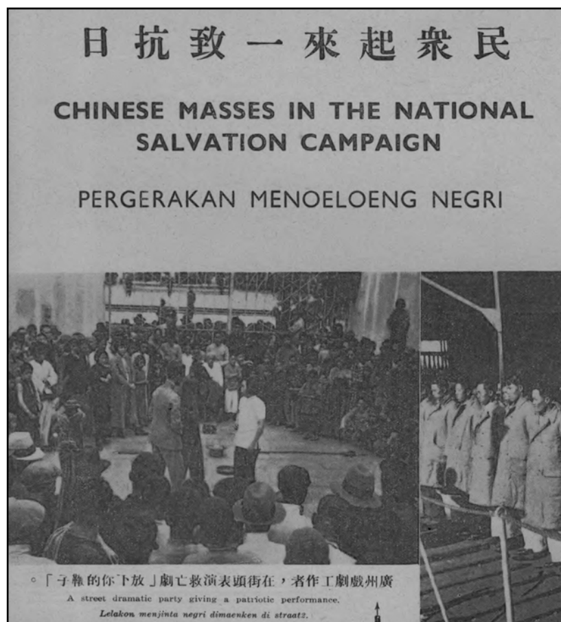
Figure 3. Pictorial insert of Zhonghua huabao (The China pictorial), July 1938 (67: 20). The lower Chinese caption reads: “Theater workers in Guangzhou perform a resistance play Put Down Your Whip in street.”

team in conducting, in his words, a “guerrilla war by means of theater” in Zhejiang Province in late 1937. 12