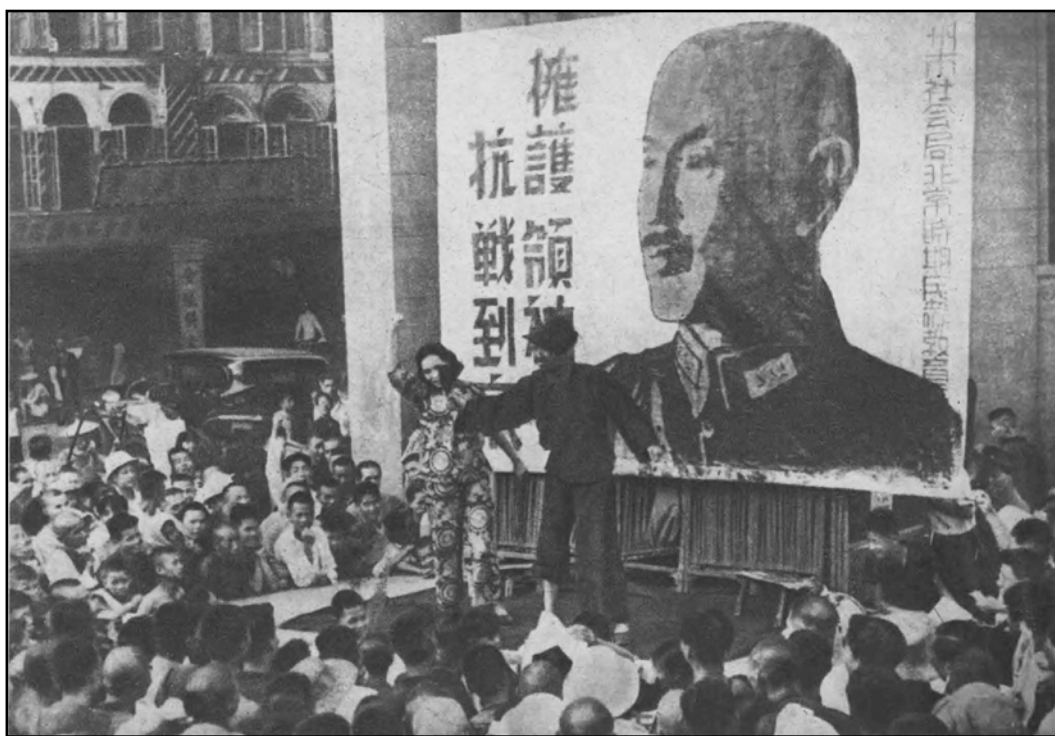
Figure 4. Photograph showing a public performance of Put Down Your Whip .

The expectation of theater, or specifically mobile theater, to deliver more than rousing feelings and to participate directly in cultural and social organization would soon receive a significant institutional boost when an emergency national congress of the Nationalist Party convened in Wuhan and adopted, on April 1, 1938, the twin agenda of “armed resistance and national reconstruction” as the basic policy of the wartime government (“Zhongguo Guomindang” 1994). On the same day, also in Wuhan, the Ministry of Political Affairs under the National Military Council established a Third Department to oversee public education and international communication. The new department, just like the ministry itself, was formed with cooperation between the Nationalists and the Communists. Guo Moruo (1892–1978), a prominent Communist writer who had at one point been hunted by the Nationalist government, was appointed its head, and Tian Han, a much-respected figure in the field of theater, was put in charge of its arts section.