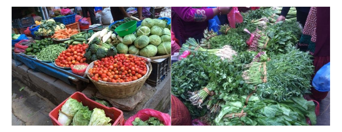
One of the many fruit and vegetable markets in Kathmundu. Nepal is a country with abundant production of foods of plant origin, including many that are good or rich sources of vitamin A

The vitamin A programme has been described as one of the most sustainable public health interventions in Nepal (6-8). In reality what is being sustained is dependence on the influence of 'donors' who no longer donate capsules, but who still effectively control the Nepalese vitamin A and other public health and nutrition interventions. This has been characterised as putting government in the taxi-driver's seat, while the non-paying passenger sits back and instructs the driver where to go (9).