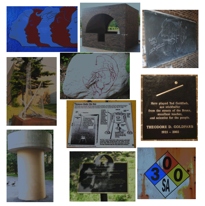
Figure 1: Close-up views of 10 targets seen by Givers ( L to R, top to bottom ): Patriotic faces, Mushroom house, Outside chalkboard, Ship sculpture, Sorority rock with girl, Spaceship label, Goldfarb plaque, Cylindrical cement structure, Cedar plaque, Warning sticker

Status of Corpus Project The corpus being released to the research community includes 36 digitally recorded spoken dialogues (with associated data on individual differences and experimental parameters). The navigational dialogues from these pairs have all been transcribed in detail (including disfluencies and pauses, along with time stamps). A full article in preparation will present data on the content and sequencing of referring expressions and navigation strategies. Here, we report findings from the post-navigation recall test, entrainment data from the 6-round referential communication task, and effects of spatial ability.