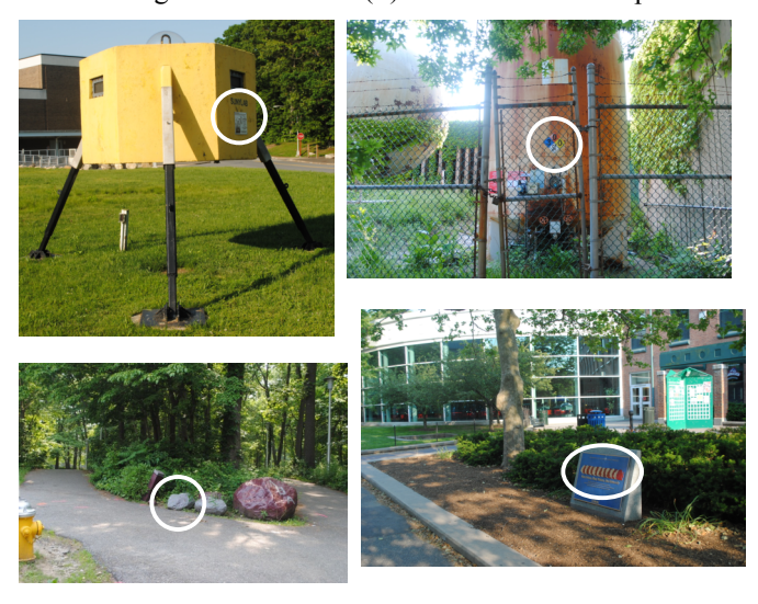
Figure 2: Extra visual context provided to Giver (without highlight) for selected targets from Fig. 1: Spaceship label, Warning sticker, Sorority rock with girl, Patriotic faces.

The student assigned to the role of direction-Giver (G) remained inside the lab with a landline phone to direct the student assigned as Follower (F) to locations on campus.