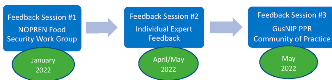
Figure 2. Graphic Representation of PPR TOC Development.

We applied a three-step process to adapt the NI TOC to develop the PPR TOC. This process is graphically represented in Figure 2. To create the PPR TOC, we sought iterative feedback and revisions on the NI TOC from food-as-medicine experts, individuals from the healthcare sector, and others involved specifically in GusNIP PPR program implementation, program evaluation, and leadership. These healthcare sector-based individuals had not been involved in the development of the NI TOC because the NI program does not include the healthcare sector.