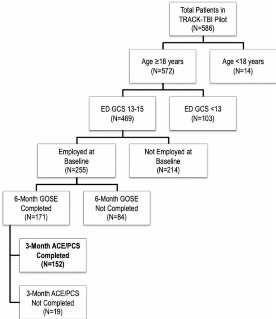
Figure 1. Flowchart of included subjects. Flowchart of included patients in the current study. ACE: acute concussion evaluation; GOSE: Glasgow Outcome Scale–Extended; PCS: postconcussional symptoms; TRACK-TBI: Transforming Research and Clinical Knowledge in Traumatic Brain Injury