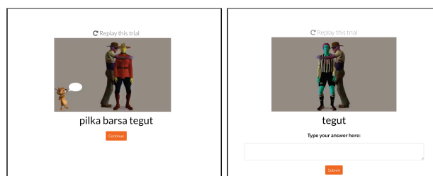
Figure 1: Examples of sentence exposure (left) and sentence production (right) trials. Pictures represent still images of the videos participants saw. The alien informant was present in each sentence-exposure video but absent during sentence-production trials.

Participants were instructed that they would be learning an “alien” language by watching short videos and hearing sentences describing them produced by an alien informant. The language contained four nouns that corresponded to humanoid referents (CHEF, MOUNTIE, REFEREE, BANDIT), two transitive verbs (KICK and HUG), and a case suffix “-dak” that (if present) attached to the object of the verb. The language was presented both auditorily and in writing; participants produced language by typing.