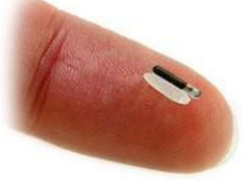
Fig. 3: A figure of the Implantable Microchip technology (Kelly Nash, 2016)

The emergence of this human implantable microchip will revolutionize the how health providers provide service to patients, how payments are processed and authorized, and most importantly how it will make consumers safer with a unique identity. This piece of technology that can potentially improve lives which only costs between $150 to $200 to implant (Tanne pg. 1). The technology is so small, size of a grain of rice (fig. 3), that it can be implanted in the palm of your hand without any complications (Michael pg.1). Like any technology, the microchip has its pros and cons but still has the potential to re-shape the world making it a safer place for consumers.