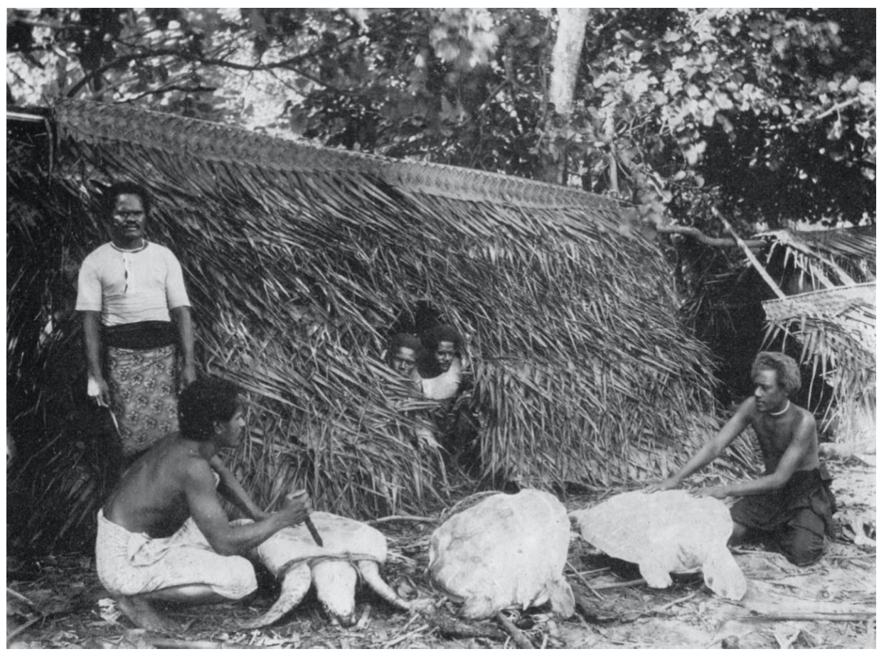
Figure 1. "Slaughtering the Turtle," photograph in Basil Thomson's The Fijians: A Study of the Decay of Custom (London: William Heinemann, 1908), 326

that the pairing of text and image across the encyclopaedia's eight volumes would inform young and old readers about the modern world, both near and far.