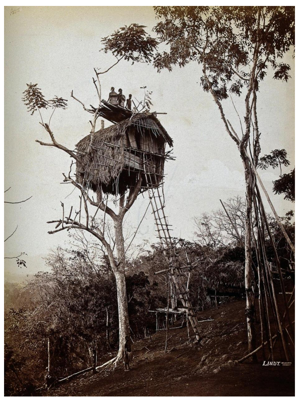
Figure 3. John William Lindt, Koiari tree house, photograph in Picturesque New Guinea (London: Longmans Green, 1887), plate XIV

government.<sup>23</sup> An alternative reading of the three-legged-stool analogy is that the three legs were the agents that protected Fiji from the unwanted consequences of joining the modern world: chiefs, Vanua (the land,) and the British. This idealized but non-existent colony was therefore depicted through an image of happy islanders preparing turtles for a feast. All these motivations, and others, may have been in place when the editor or sub-editors of The Book of Knowledge chose Thomson's turtle photograph.