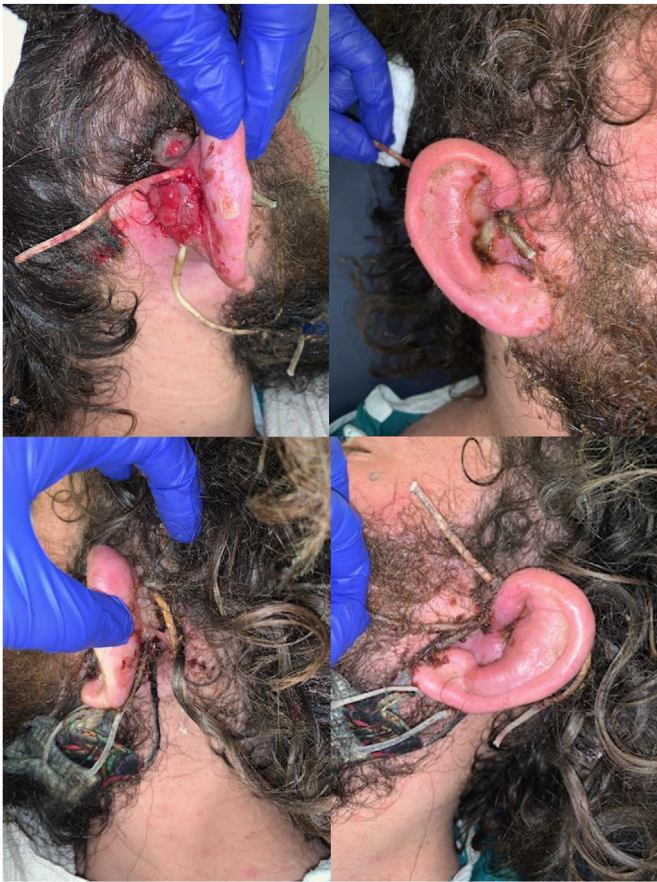
Fig. 1. Top row: right ear showing significant auricular injuries with the elastic ties of the masks eroding through the helical root toward the conchal bowl with postauricular granulation tissue; bottom row: left ear showing multiple elastic ties eroding through the helical root with auricular inflammation and erythema.

cholesteatoma, or other inner or middle ear etiologies. Due to the severity of this patient's wounds, extending through the helix and involving a large portion of the outer ear, the hospital otolaryngology team was consulted and assumed care of the patient.