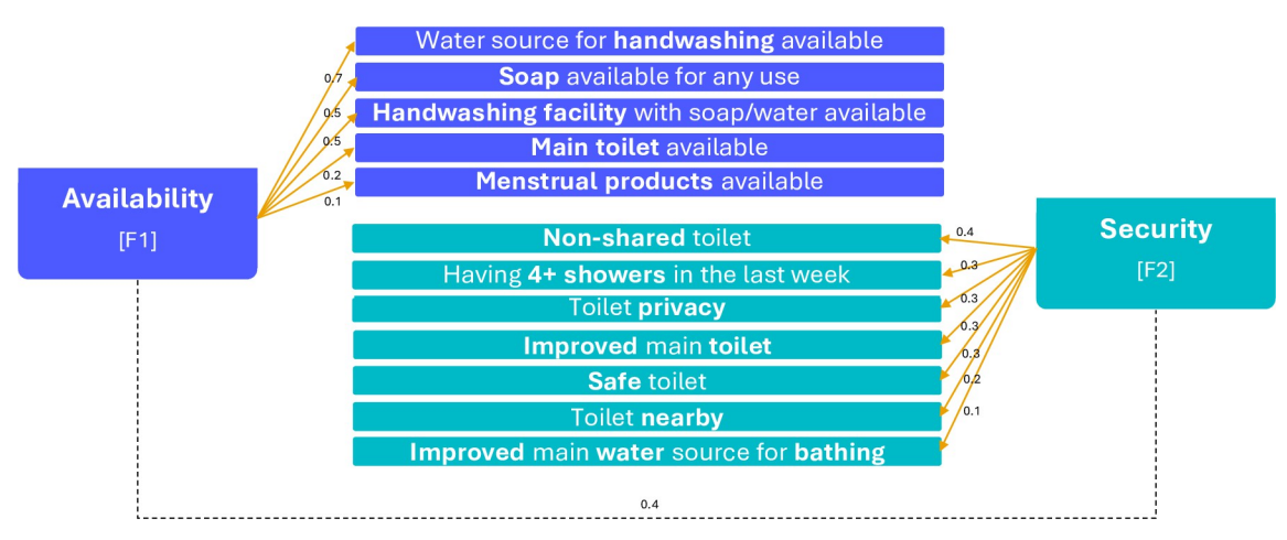
Fig 1. Factor analysis of the 'Menstrual Health WASH Domain Scale-12' items.

For the construction of the 'MH WASH Domain Scale-12', twelve items with mainly positive or neutral correlations were included. We identified that using two-factors (referred to as F1 and F2) best organized the construct (S1 Table) based on parallel and factor analyses. The identified factors corresponded to two sub-domains. Factor-1 (F1) included five items (water for handwashing available, soap available for any use, handwashing facility with water and soap available, main toilet available, and menstrual products) broadly related to the availability of WASH sources, and consequently we defined it as the 'WASH Availability' sub-scale (Fig 1). Factor-2 (F2) contained seven items related to 'WASH Security'—encompassing physical and biological safety—including improved water sources for bathing, and access to improved, nearby (<10 min walking), non-shared, private, and safe toilet facilities. These sub-scale items contained two areas: a) the security of the water used (for bathing) as defined by appropriateness for human consumption or use without health risk and b) physical security accessing sanitation facilities. In sum, this process resulted in two sub-scales: 'WASH availability' and 'WASH security'.