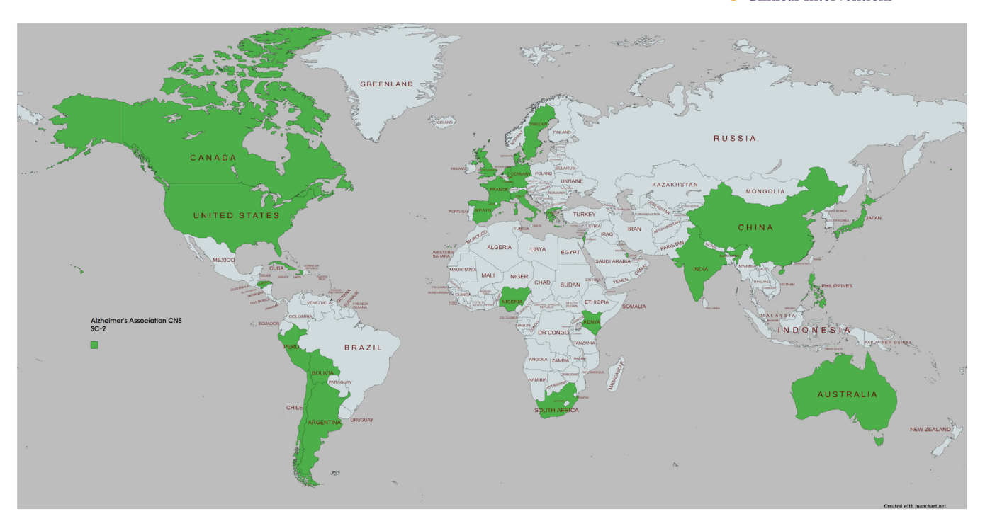
FIGURE 1 Map of countries of origin of Consortium members

NCT03861884). Most ongoing data collection (for instance in Canada, Greece, England, South Africa, and in San Antonio, Texas, USA) follow this model.