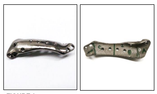
FIGURE 3: Additively manufactured Ti 6AL4V bone plate to correct radial deformity. The finished top surface (left) and the unfinished bottom surface (right) are shown.