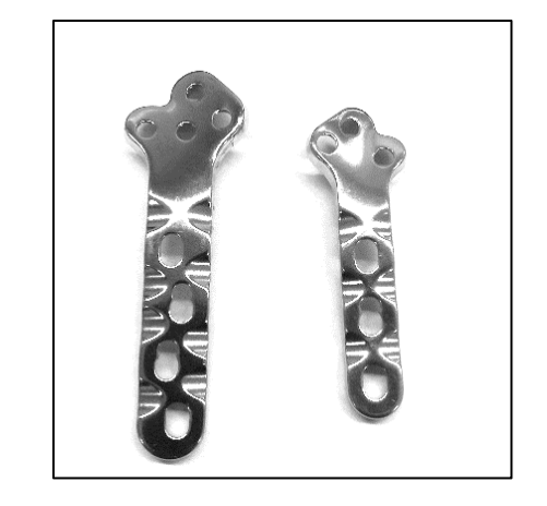
FIGURE 4: Tibial plateau leveling osteotomy (TPLO) plate for a small animal

With metal AM, casting molds are not required to manufacture the implants [10].