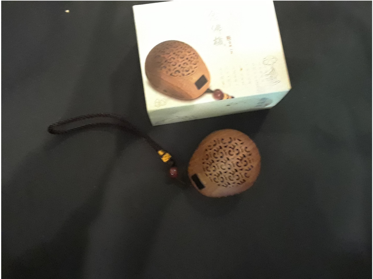
Figure 8: Digital Chant Machine for Learning Funeral Chants