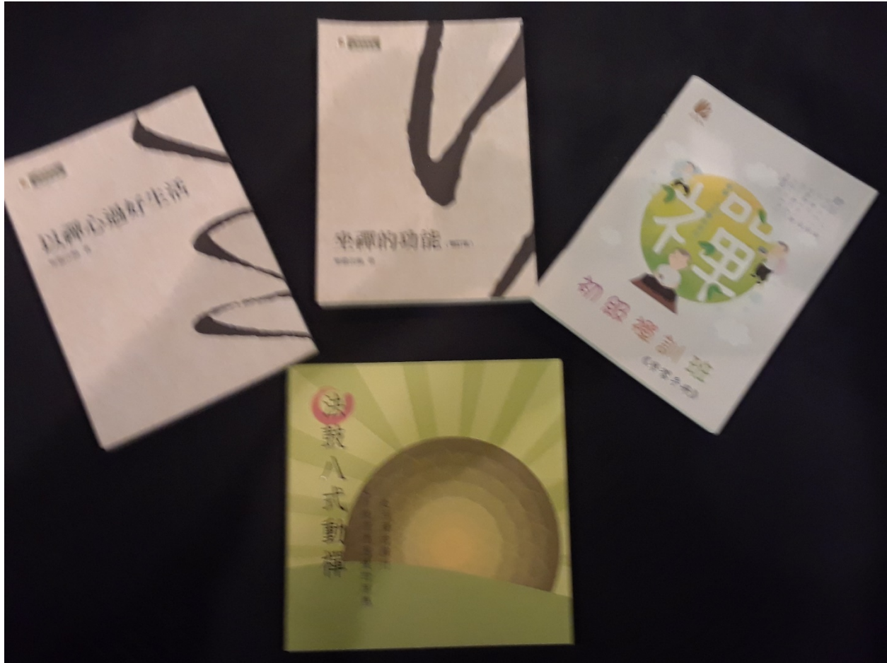
Figure 10: Weekly Gifts from Chan Meditation Class—books with pointers on how to practice meditation