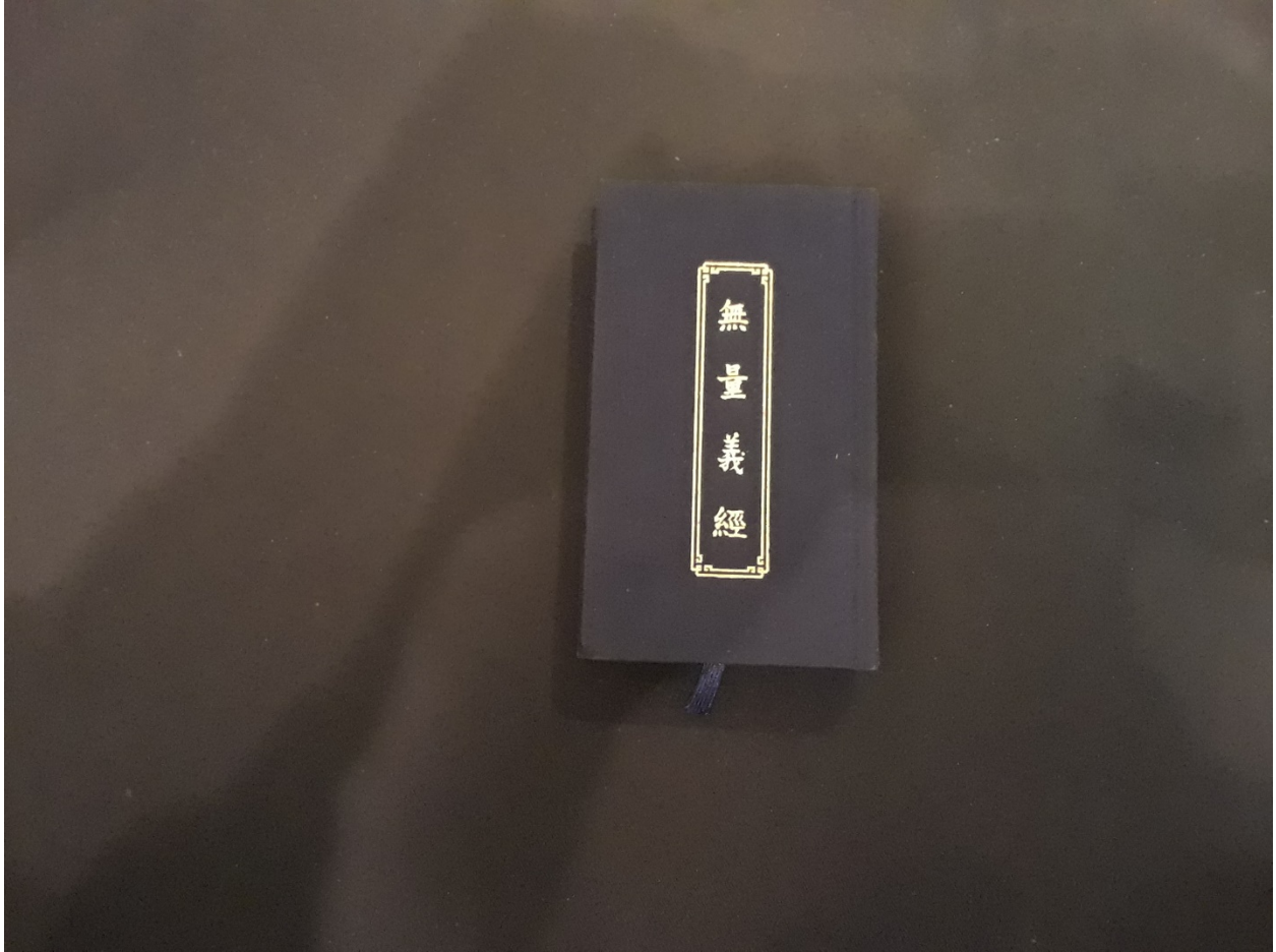
Figure 14: Sutra of Infinite Meanings from Master Cheng Yen