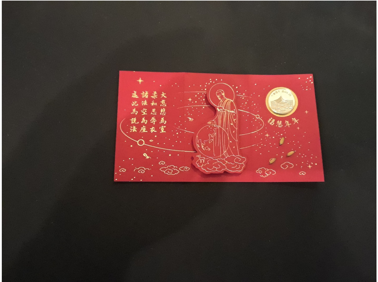
Figure 15: Hand-Assembled Lunar New Year Card from Nuns at Tzu Chi's Abode of Still Thoughts, Wishing the Recipient Blessings and Wisdom Year after Year