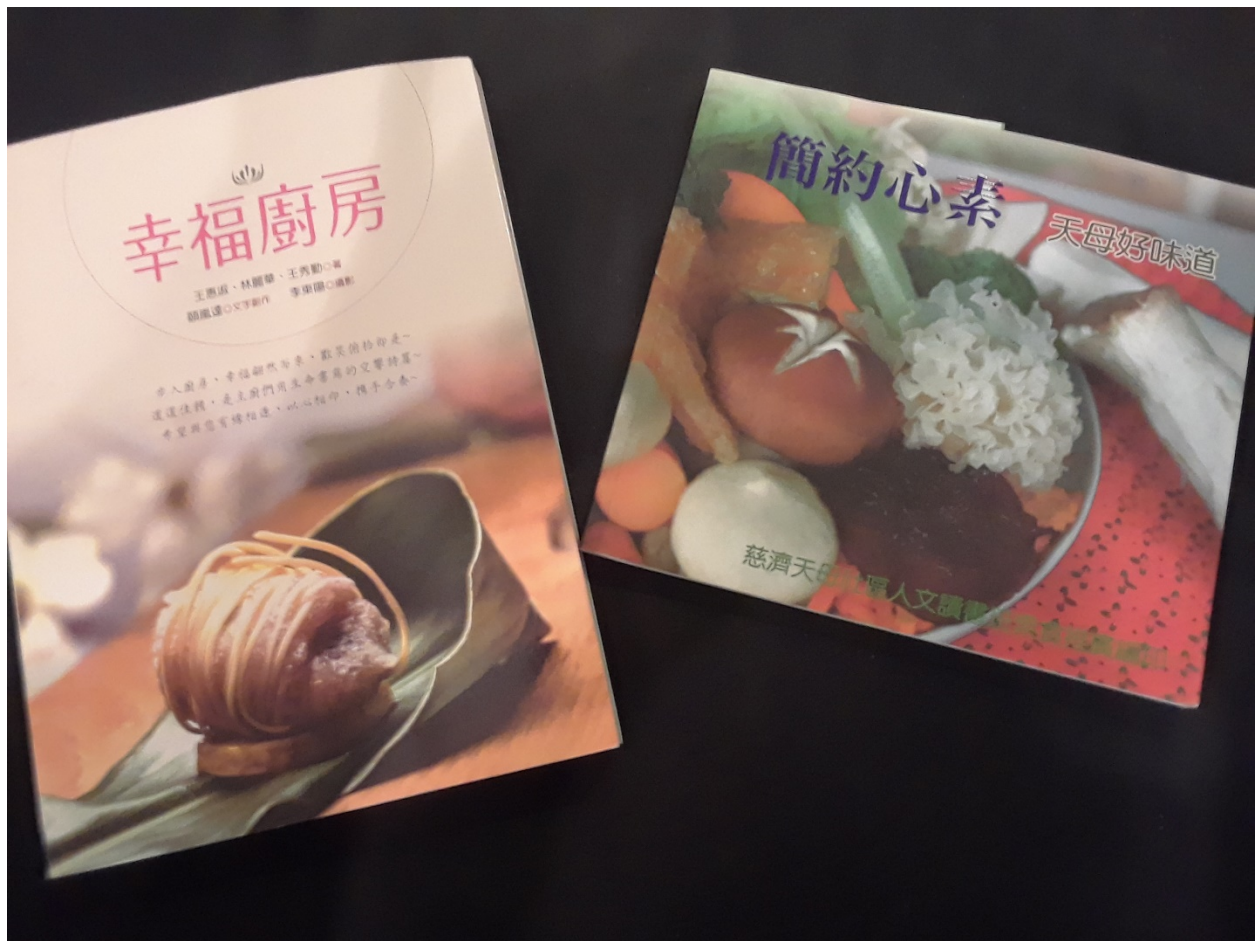
Figure 7: Books from Interviewees—Vegan Cookbooks Made by Volunteers entitled The Blessed Kitchen (left) and Simple, Heart-felt Vegetarianism (right)