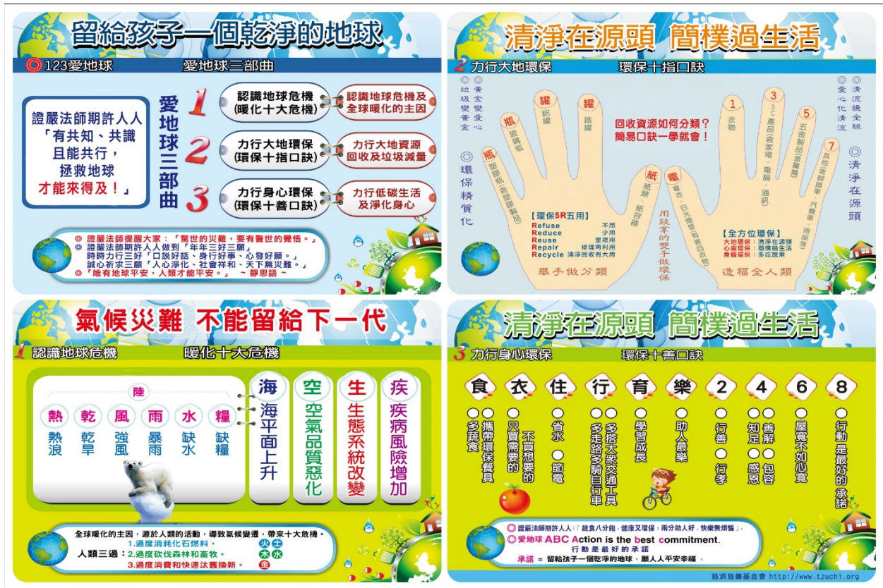
Figure 2: Tzu Chi’s 2017 Environmental Flyer Side A

The 2017 summary of Tzu Chi’s teachings on environmentalism can be found on the Foundation’s latest comprehensive environmental flyer, which is a two-sided sheet of size A4 paper (see Figures 2 and 3). It is meant to be folded in half to show four different pages. The first half page tells the purpose of and need for the organization’s environmental mission. It has two banner lines that read: “Let us leave a clean planet to our children,” and “We cannot leave environmental catastrophes to the next generation.” The top part of the page tells people that they will be reading a trilogy of love for the Earth, which consists of 1) knowing the danger to the Earth; 2) practicing recycling and reducing consumption to save the Earth; 3) practicing environmentalism of the mind and heart by living a low-carbon lifestyle with a purified heart.