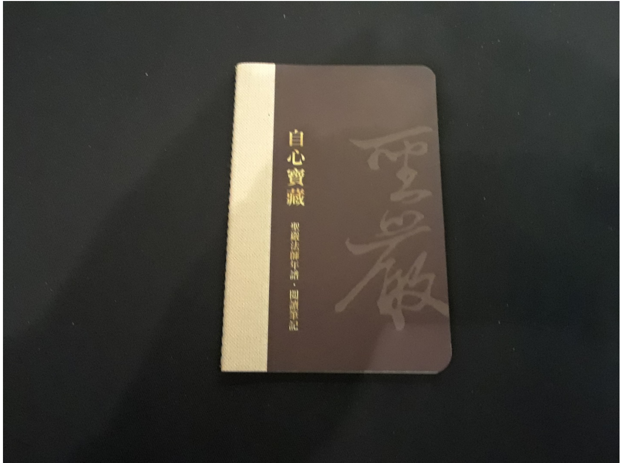
Figure 11: Gift from Dharma Drum Mountain Lecture—a small notebook for recording one's thoughts