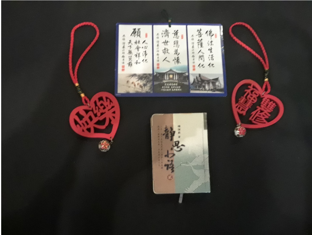
Figure 4: Devotional Cards with Buddhist Aphorisms, Decorative Objects that say “Happiness” (left) and “Blessings and Wisdom” (right), and Booklet of Buddhist Aphorisms from the Teachings of Master Cheng Yen