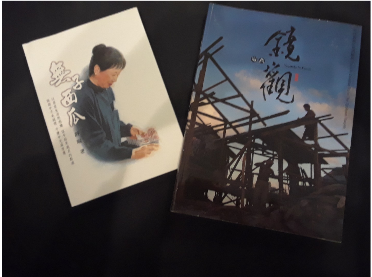
Figure 5: Books from Focus Group Members with their Own Stories that Emphasize the Benefits of Service to Humanity