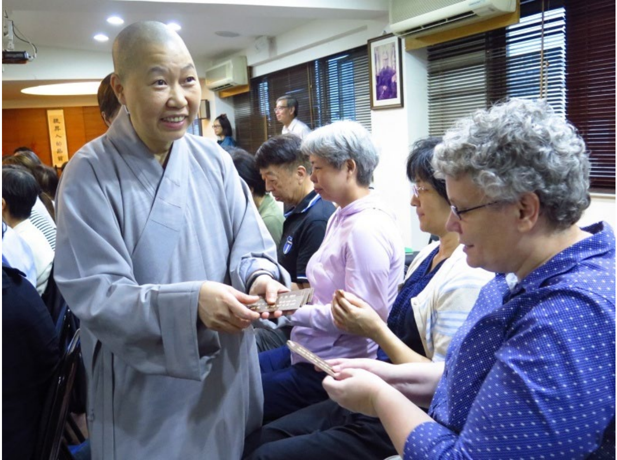
Figure 12: Receiving Gifts from the Nun Teaching the Class