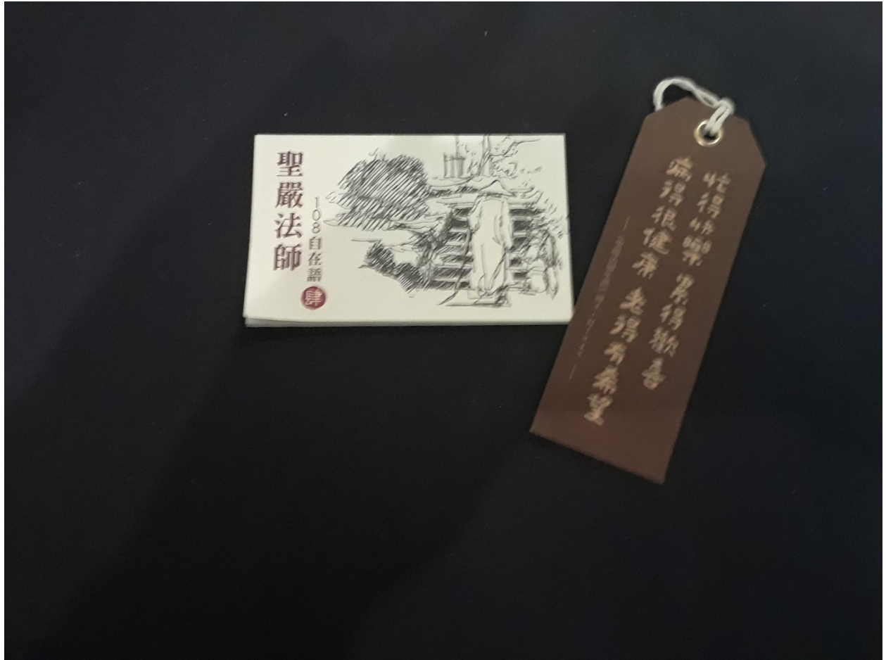
Figure 9: Gifts from Happy Buddhist Studies Class and Lecture on Dharma Drum Mountain's History—108 Buddhist aphorisms drawn from the teachings of Master Sheng Yen and a bookmark with Buddhist aphorisms