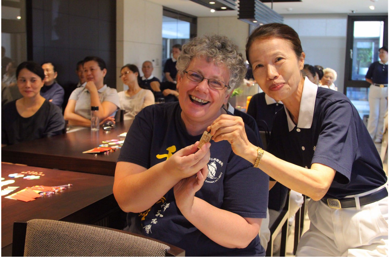
Figure 13: Receiving my Prize at the Tzu Chi Community Tea