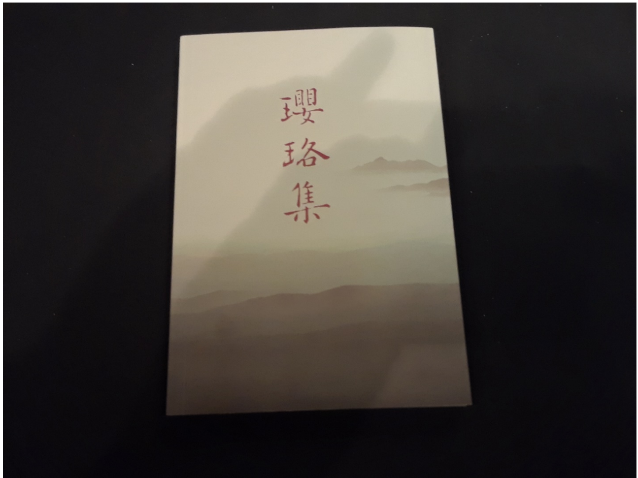
Figure 6: Funeral Memorial Booklet Commemorating the Life Story of the Interviewee's Mother and her Service to Buddhism and her Family