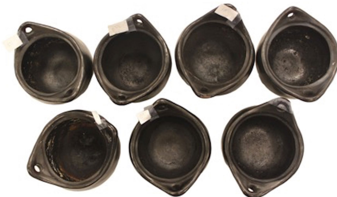
Figure 1. Unglazed “La Chamba” pottery used for each cooking experiment; photo taken after the final cooking event (carbonized organic patina residue and charred macro-remains are visible inside the pots).