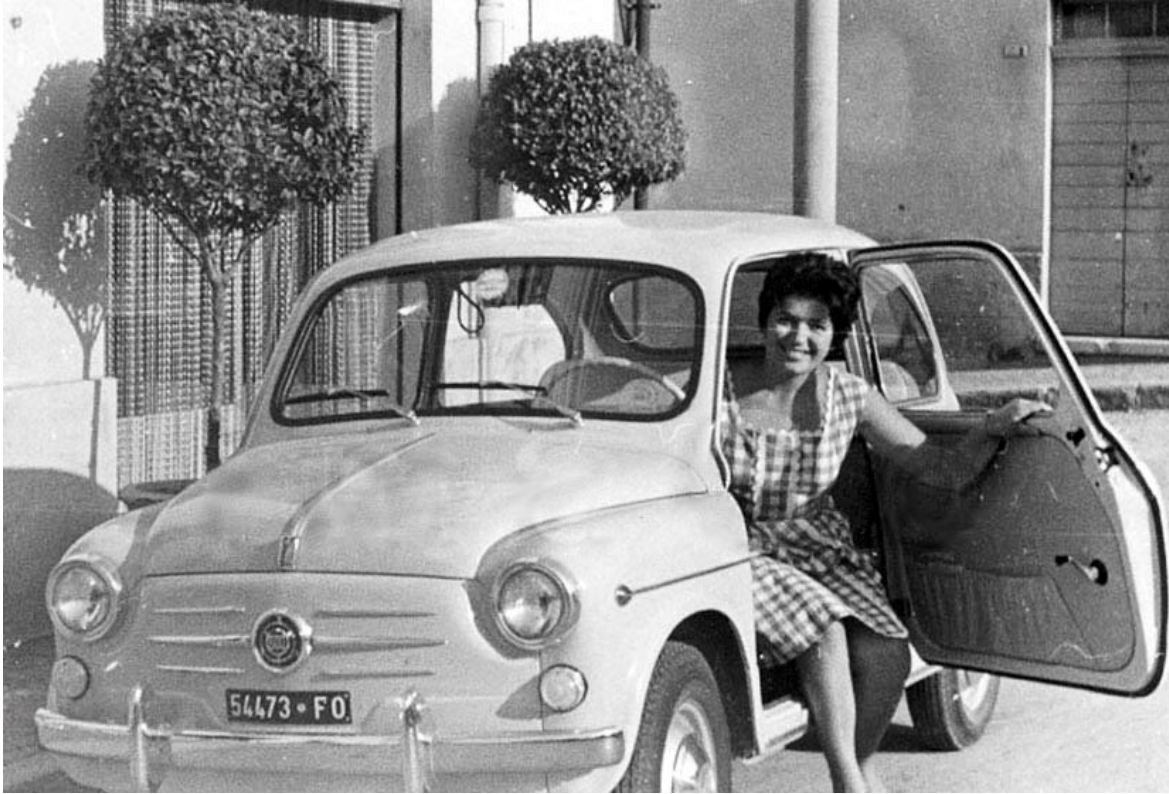
Fig. 1. Woman exiting a Fiat 600 in 1962.

It's not too early, however, to notice something curious, perhaps contradictory in the image, namely the ways in which it combines not only motion and emotion, but also movement and stasis. On the one hand, it is a snapshot, a frozen moment in time, and on the other hand, it is clearly a snapshot of time unfolding, the woman exiting her vehicle; on the one hand, it is a picture of the image of mobility (the Fiat), and on the other hand, the car is obviously stopped. On a formal level, the image combines—as photographs often do—multiple temporal registers. There is not only the background motionlessness (Barthes' studium ), but also the emergence of movement from inside the vehicle (the punctum )—and of course, Barthes' most provocative point, the curious temporality of older photographs, which for him is always the awareness of the eventual death of the subject of the photograph. 5 We see a moment in the past of expectation, a woman who looks towards the future—more than half a century ago.