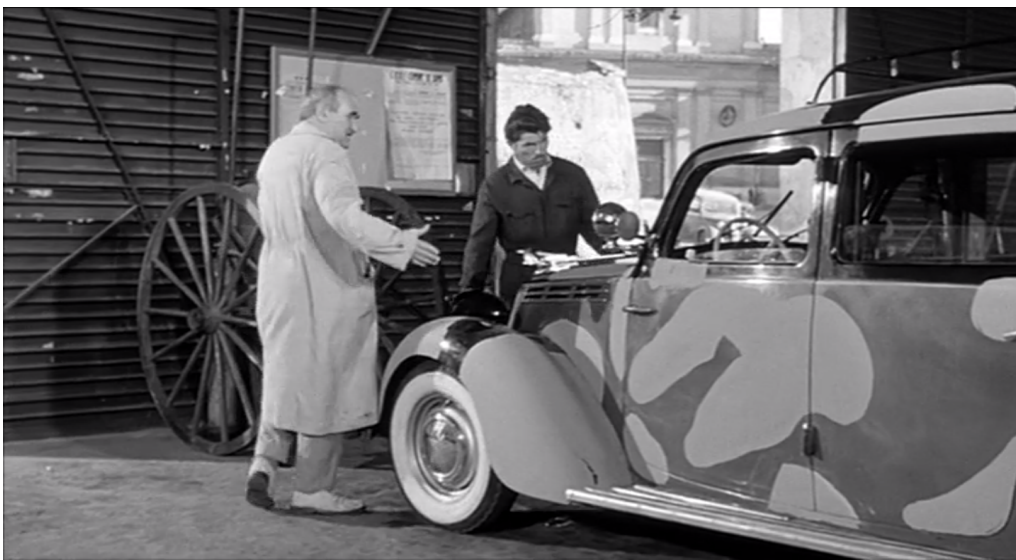
Fig. 5. The once-perfect exterior, now blemish and stain. Peccato che sia una canaglia , 1955, Documento Film.