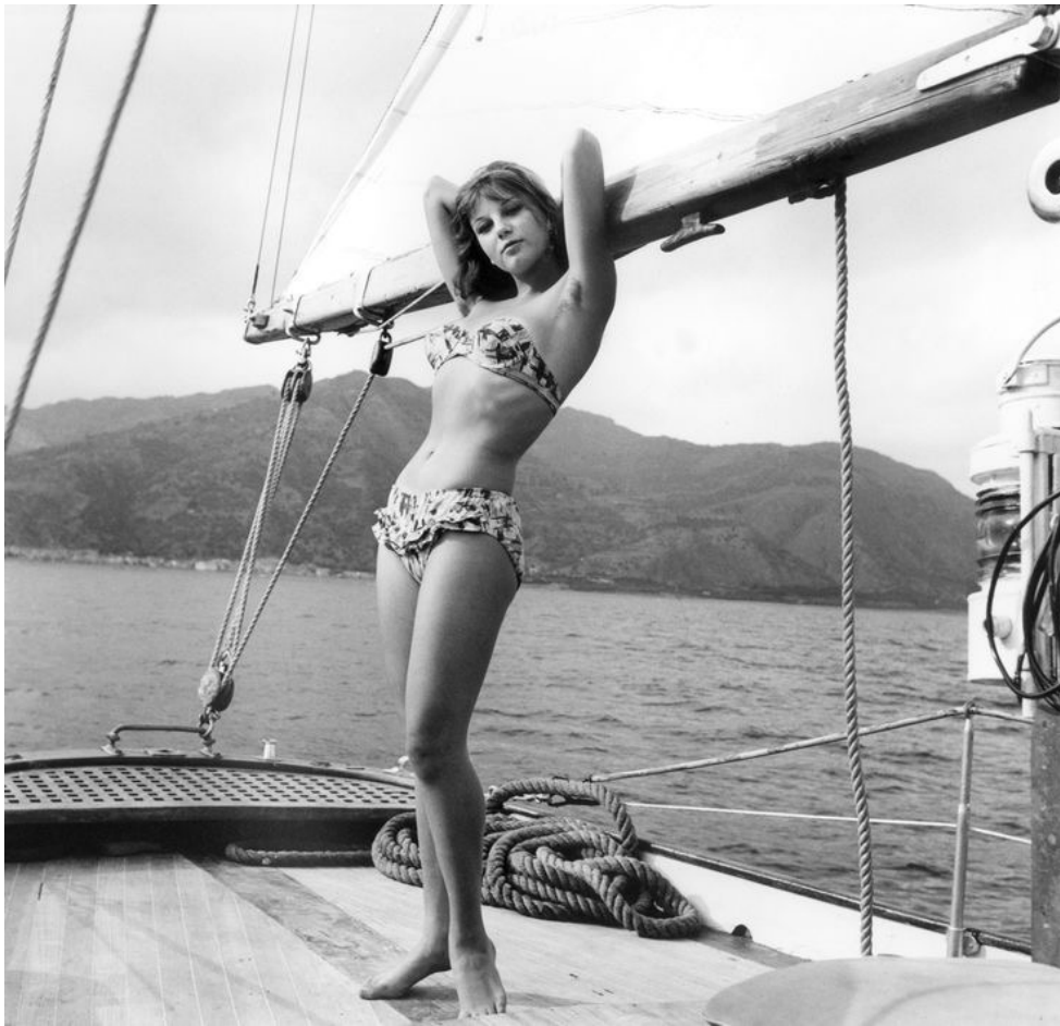
Fig. 6. The bikini and the boat: two iconic images of freedom of movement. Divorzio all'italiana , 1961, Lux Film.

showing the two always contaminating each other. In a film like Divorzio all'italiana , Mastroianni plays the aristocrat Fefé Cefalù, whose public respectability as a loving and faithful husband is not simply a façade, but a constantly and visibly crumbling one. 32 The comedic element, of course, is that in order to pursue his desire—his sixteen-year-old cousin—he must induce his wife to cheat on him so that he may kill her without serious legal repercussions. (At the time of the film's release, Sicily still had a perfunctory three-year sentence for such “honor killings.”)