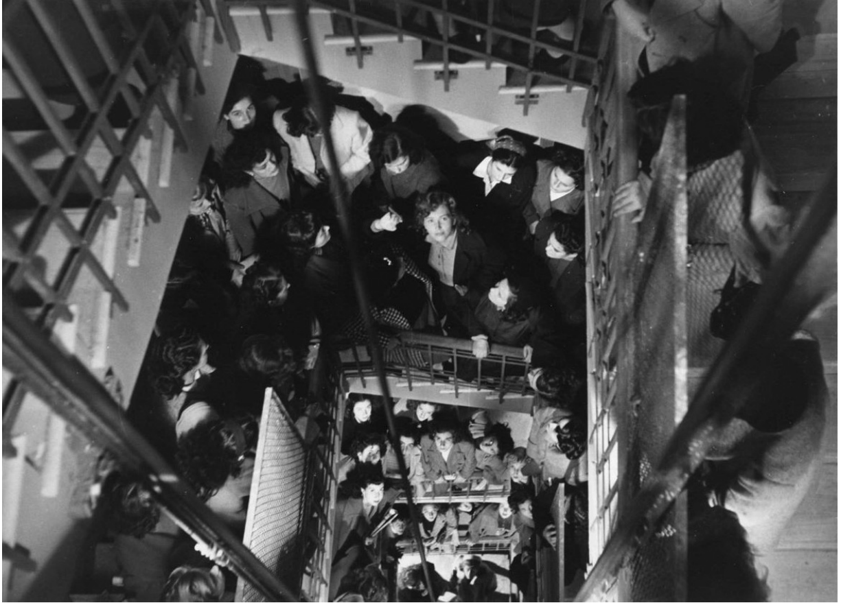
Fig. 3. The endless spiral staircase of job seekers. Roma: ore undici , 1957, Titanus.