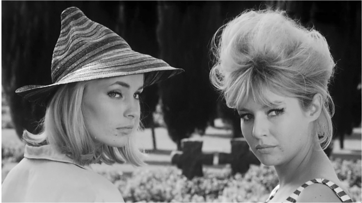
Figs. 7 and 8. From “come hither” to the cemetery. Il sorpasso , 1962, Incei Film.