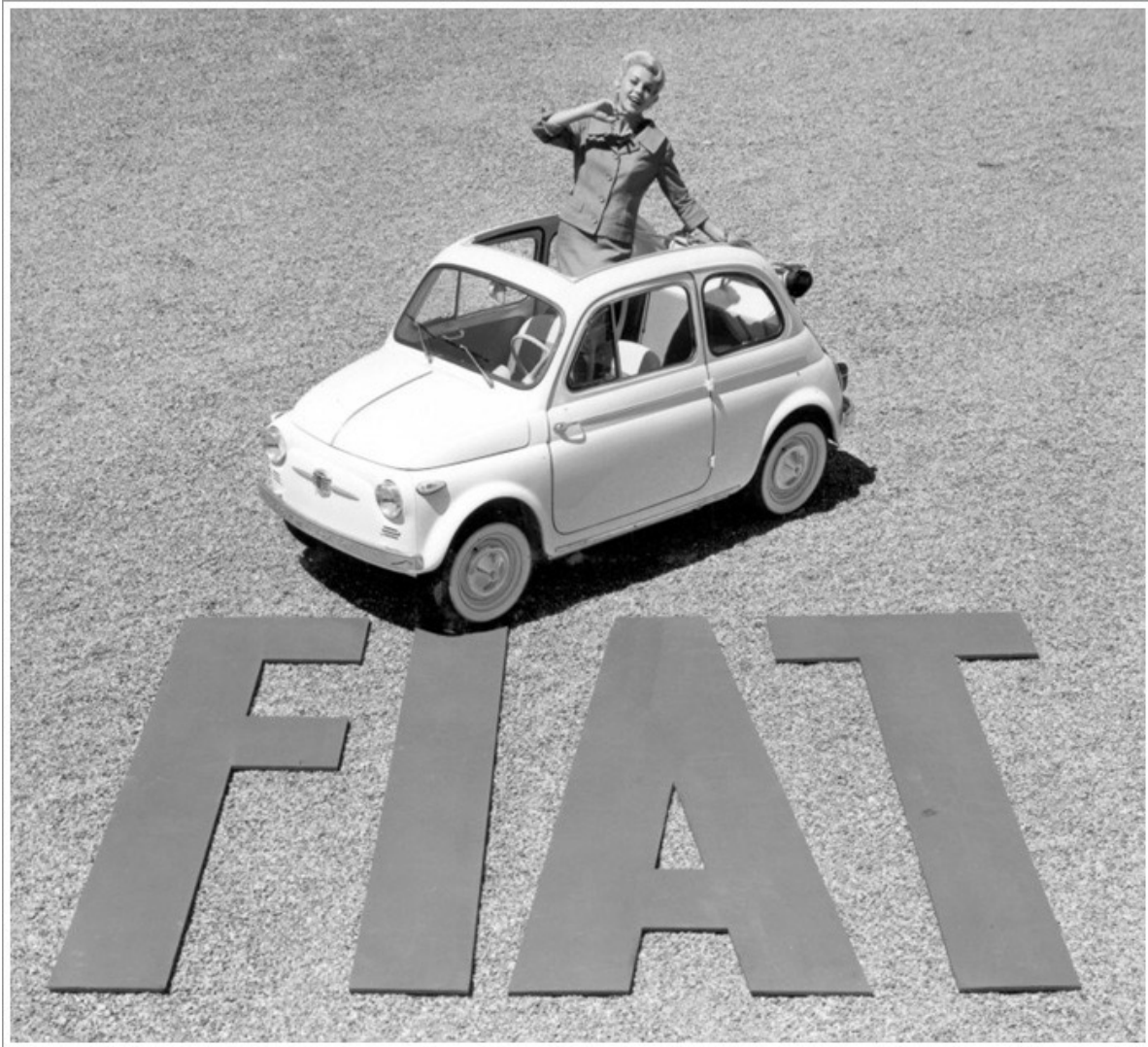
Fig. 2. The independent female driver.

very quickly. One particular difference that Gorgolini notes is that Italian television made almost no effort to capture the youth market, while films beginning in the 1950s “presentavano come protagonista un emergente universo giovanile” (presented an emerging world of young people as their protagonist). 7 By implication, neorealism had suffered at the box office because it attempted to portray the poverty, misery, and destruction left after the war, rather than the seductive and emergent world of youth, vitality, luxury, and new consumer goods.