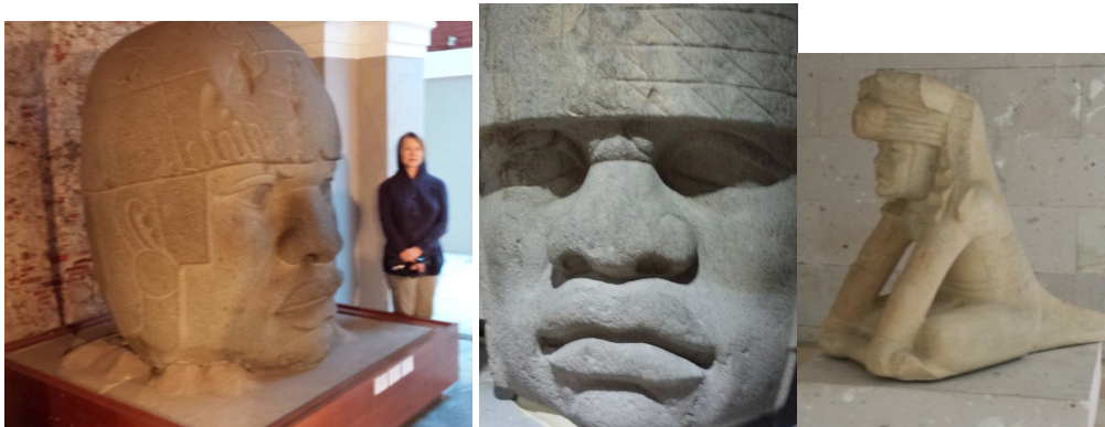
Figs. 5, 6. Left and middle: Two of over a dozen colossal heads. Dated well before the Christian era, found near Veracruz during the 20 th century, now in the Museo de Antropología de Xalapa , and ascribed to the pre-Mayan Olmecs. The features and headgear seem possibly to be African. Author is pictured to show scale. Fig. 7. Right: One of two Olmec-era sphinxlike statues in museum..

Here is part of a translation of a Mandingan jali 's opening phrases from the thirteenth century: