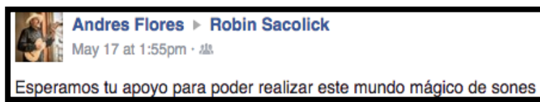
Fig. 12. Author’s May 2016 Facebook feed.