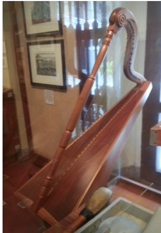
Fig. 10. Arpa jarocha . City Museum of Veracruz. Diatonic construction, 32-36 strings.