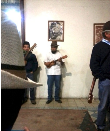
Fig. 11. Musicians around tarima . Coatepec, Veracruz's Estrella de Oro 150-year-old cantina.

The sequence of a Bay Area fandango might proceed as follows. While it may take place indoors or outdoors, in a home, studio or park, the center of the space is always the tarima (low wooden platform for one to several dancers.) Many of the attendees, who dance, sing and/or play instruments, stand in a loose circle around the tarima with their jaranas , requintos , quijadas , marimbolas , violins or harps. The leaders of the events, often known as maestra/os , stand together close to the tarima . Participants who choose not to play or dance, but rather to watch and convivir , may sit in chairs surrounding the musicians' circle, near the food and beverages. This circular arrangement recalls some Native American and African rituals.