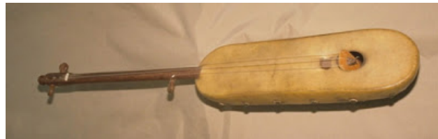
Fig. 8. Left: Jarana under construction. Xalapa, Veracruz laudería (lutherie) of Ramón Gutierrez Hernández. The neck and body are carved from a single piece of wood. Fig. 9. Right: Malian ngoni . Similar size, with resonator carved from wood, but membrane face and separate neck. This shape is shown being held high on the chest like a jarana in ancient Egyptian pictographs (Charry, 1996).

propitiation of the materials, the practice of maintaining an open string, and the very name “ jarana .”