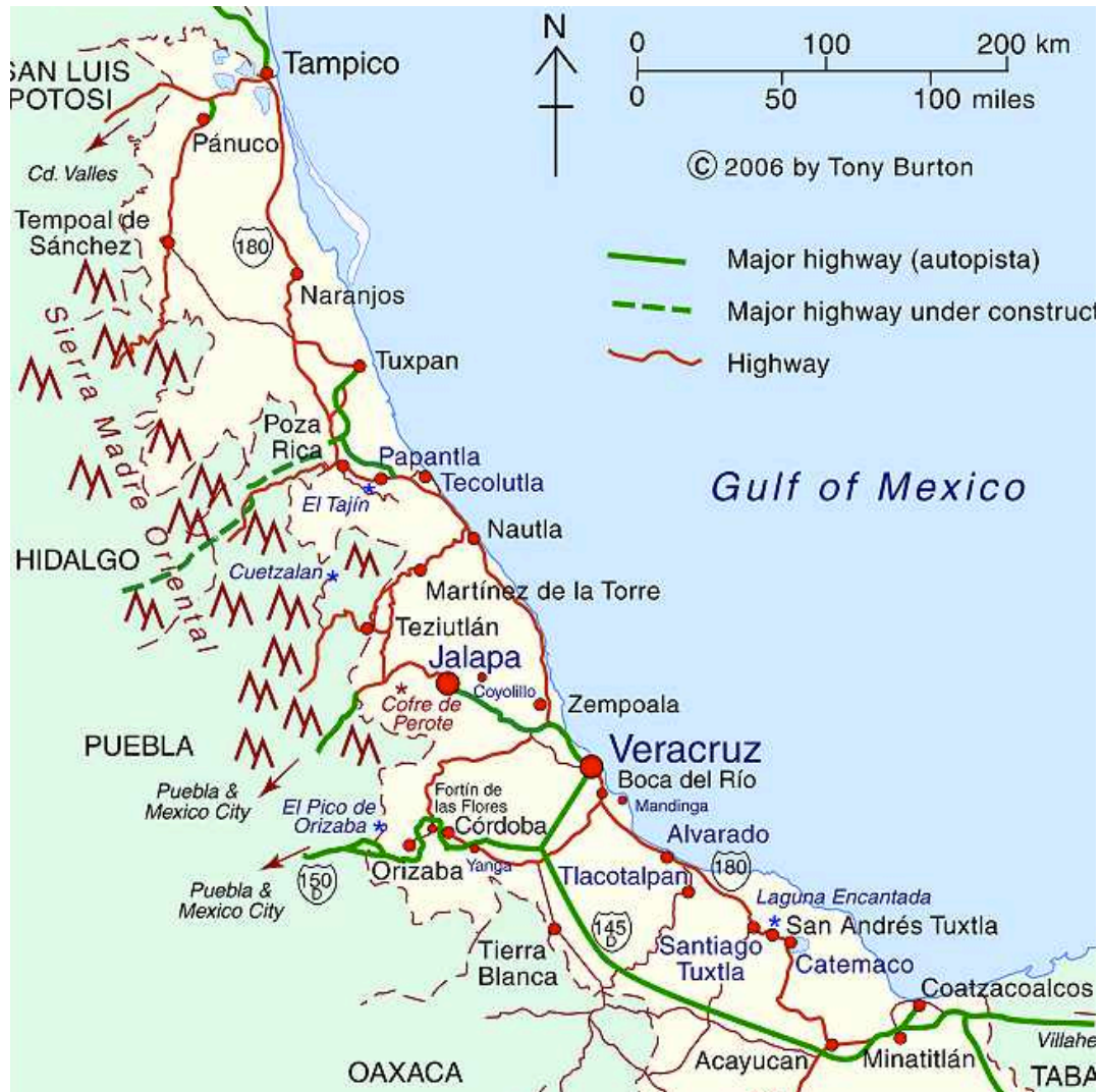
Fig. 1 Map 1. Veracruz

This map depicts important sites such as Veracruz the port, Jalapa the capital, Coatzacoalcos of the Olmec region bordering “Mayan Riviera,” Santiago Tuxtla and Catemaco, Tlacotalpan and Alvarado sometimes considered the cradle of son jarocho , Mandinga and Yanga both evincing African origin, the ancient Totonac pyramids at Zempoala and the Totonac/Huastec pyramids at El Tajín.