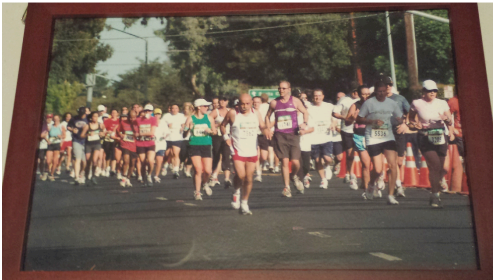
Fig. 15. Maestro finishes another marathon, leading a pack. From his studio.

The nobility of son extends, thus, beyond the genre to its practitioners and core community values. It includes humility, dedication, perseverance, generosity and respect, as the Maestro teaches by example. In June 2016, he was awarded the National Endowment for the Arts' highest honor in Folk and Traditional Arts: that of Bess Lomax Hawes National Heritage Fellow—a most deserved award!