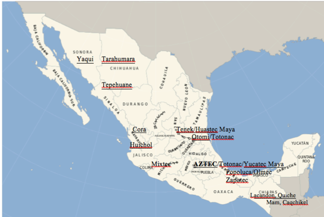
Fig. 2. Map 2. Conceptual map of locations of indigenous groups in Mesoamerica Locations depicted are relative, not absolute.