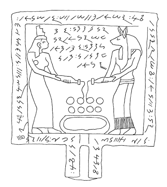
Figure 1. Meroitic funerary offering-table, from Sai Island (250 – 300 CE).

The corpus of Meroitic texts, as published in the REM (Leclant et al. 2000) and its appendices (Carrier 2000, 2001, 2002, 2003), includes some 1300 texts. The unpublished examples, mainly found at Qasr Ibrim and Musawwarat el-Sufra, amount to approximately 900. They are of various lengths, ranging from just a few characters to the 161 lines of King Taneyidamani's stele from Jebel Barkal (REM 1044). Half of the published corpus consists of funerary texts, written on stelae or offering-tables (fig. 1). The longest Meroitic documents are royal inscriptions. Unfortunately no more than two dozen of these have thus far been recovered. Temple inscriptions, mostly captions for royal cult scenes, are attested at Naga, Meroe, Amara, and Dangeil. Some 250 graffiti are known, mostly written by pilgrims in the temples of Philae, Kawa, and Musawwarat. A special category of 16 texts, written on various materials such as potsherds, papyrus strips, leather bands, or wooden tablets, comprises what are presumably the Meroitic descendants of Egyptian amuletic texts, which offered magical protection to their owners (Rilly 2000). Finally, some 70 ostraca, predominantly short texts with numbers, are the evident traces of administrative and commercial activities