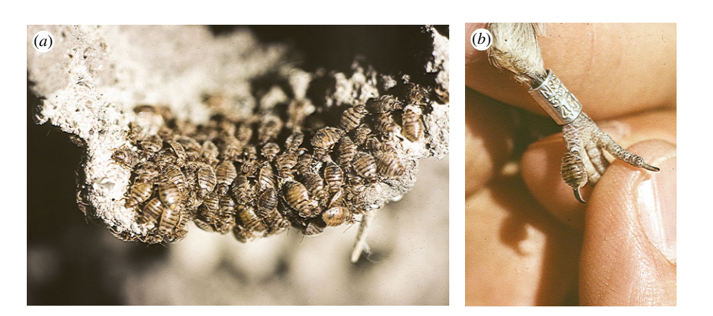
Figure 1. ( a ) Swallow bugs clustering at the entrance of an unused cliff swallow nest before dispersing by crawling onto the legs or feet of a transient cliff swallow investigating the nest. ( b ) A swallow bug dispersing by clinging to the foot of a transient cliff swallow captured in a mist net at an established colony site.

and mortality can be high. Thus, if a colony site is unused by birds in a given summer, some of the bugs there will disperse in attempts to find an active colony that can support their reproduction that season. When the wingless bugs disperse from an inactive colony site, they do so by first clustering at nest entrances (figure 1 a ). They then climb onto the legs and feet of transient cliff swallows (figure 1 b ) that investigate nests at inactive sites before flying to an active colony, where the bugs crawl off onto nests that the birds visit [17]. Birds are not known to pick bugs off their feet, probably deterred by the noxious scent glands present in cimicids [18].