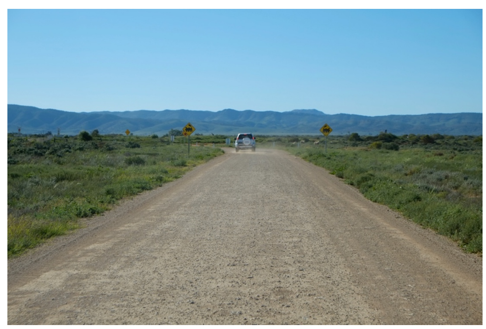
Figure 1 The Australian outback in a four wheeled drive near Port Augusta, South Australia, 2014.

experience on this desert mission is expressed through the emotions, experiences, and senses of self I seek. While these emotions are mine and not necessarily in any way those of the cameleers, I believe such sentiments can offer special insight into the relation between the Afghans and the places they lived and worked. From buildings through signs, spatial(ly violent) behaviour, and architectural pilgrimage, I notice a connectedness worth measuring. I want to write as much about architecture (strong in the sense that it is present, you can touch it, it is hard) and that which is gentle yet weak (namely the dusty remains of architecture no longer), as much about strength as the violence of time and what it confiscates from our vision. That is, I want to know and experience how time can forcefully remove previously strong artefacts like buildings and appropriate their physical memory.