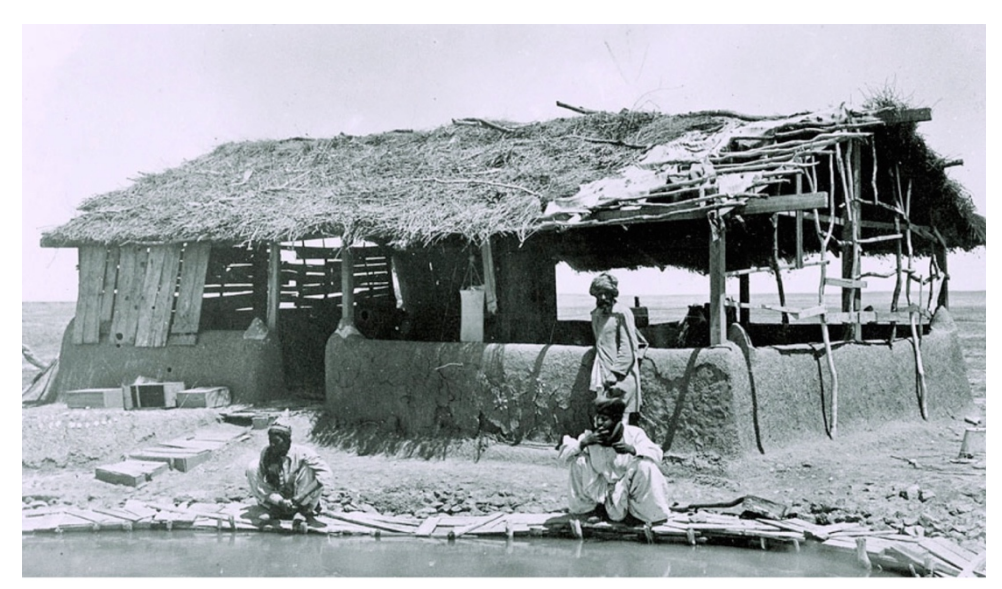
Figure 3 One of the earliest documented mosques in Australia, Hergott Springs (officially renamed Marree in 1883), South Australia, 1884.

documentation (Australian linguist Jane Simpson lists some of these records), but there is much less than I expected.