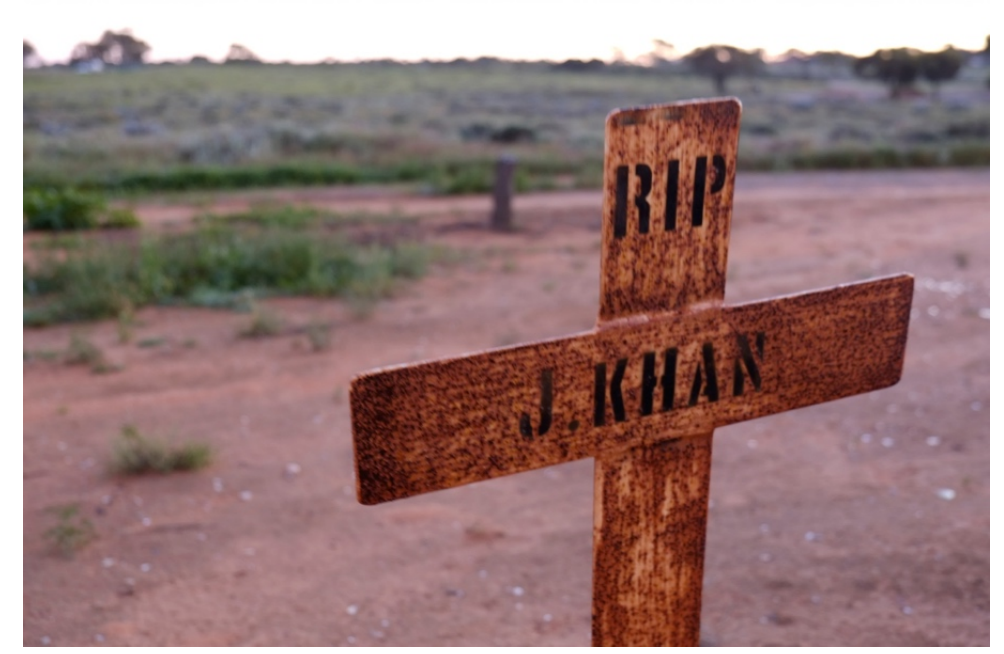
Figure 4 Cross depicting J. Khan, Port Augusta Cemetery, South Australia, 2014.