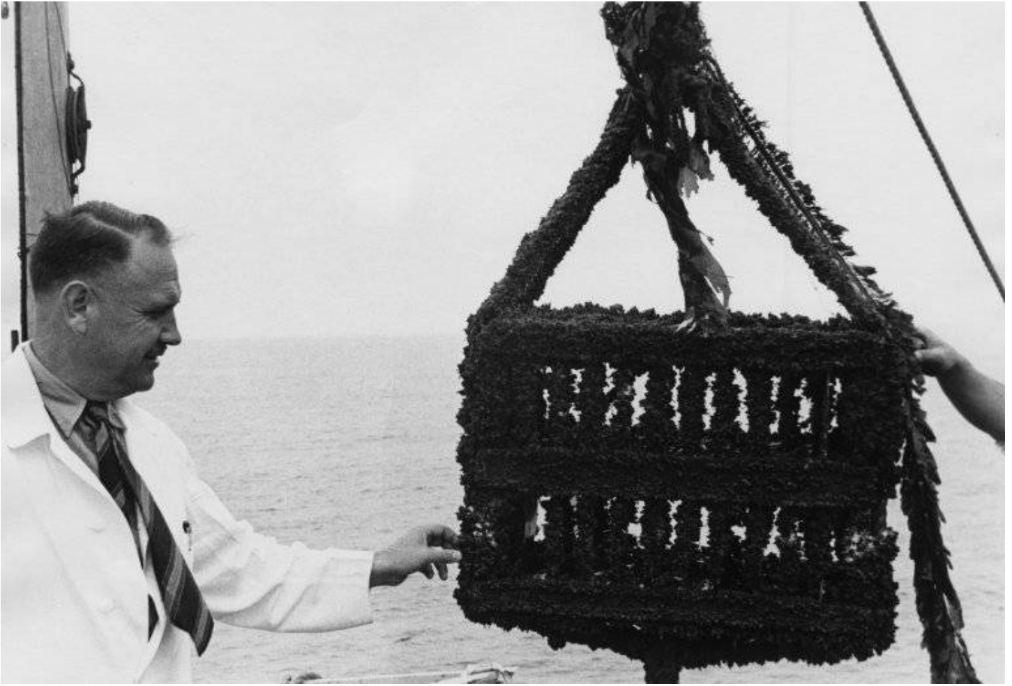
Fouling experiment, 1944