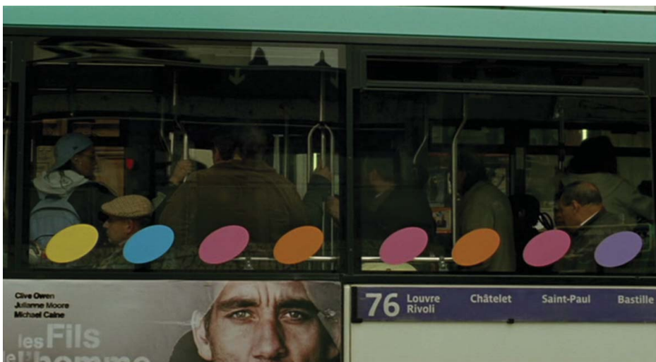
Figure 9. Bus advertising Alfonso Cuarón's Children of Men in Flight of the Red Balloon .

Although Hou alludes with admiration to 'western auteurs' such as Alfonso Cuarón, whose Children of Men is advertised on the second #76 bus, he engages in equal opportunity homage (Figure 9). Like Tsai, Hou 'winks at' not just the work of other Taiwanese auteurs, but even his own work. As suggested above, and as Emmanuel Lévy (2007) states, 'The sequence of the Chinese puppeteer show brings to mind Hou's "The Puppet Master" [ Ximeng rensheng ] which won the Special Jury Prize at Cannes Festival'. Like the eponymous character of his 1993 film, Hou is already a 'Taiwanese master' (Darghis 2008). Indeed, Flight's Ah Zhong serves as an even more obvious and compelling alter ego to Hou than Song, who is only a novice filmmaker. Whereas she represents the next generation, Ah Zhong is by definition a 'master'. Following Ah Zhong's demonstration to the workshop students, Suzanne explains that typically, each character who enters the scene presents a poem and only a very accomplished master has the licence to improvise ('change a few rhythms'). Hou's own arrival at a stage