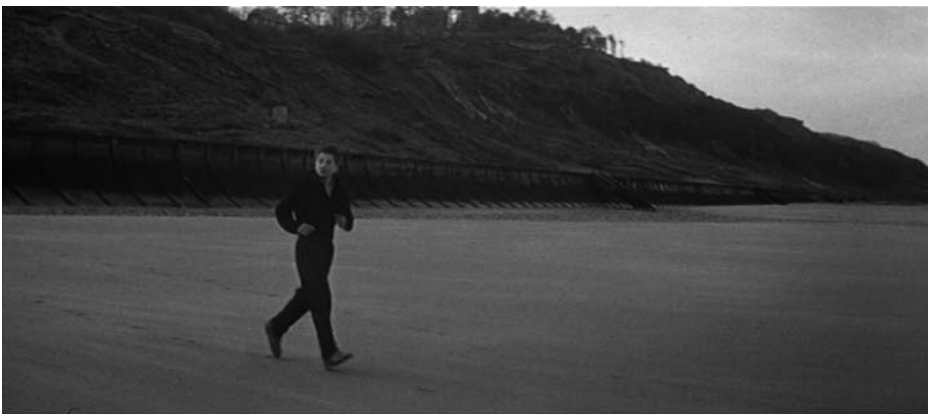
Figure 1. Antoine Doinel (Jean-Pierre L  aud) jogging toward the sea in The 400 Blows .

Yang-Yang's last scene harks back to the French New Wave, and particularly the famous final sequences of both The 400 Blows and Breathless . Whereas Antoine escapes from the observation centre, Yang-Yang runs away from her agent Ming-Ren and her difficult experience shooting the last scene of the film-within-the-film, in which she plays a character so closely based on herself that it is painful. Yang-Yang's final flight from the pain provoked by the absence of her father, mirrored in the situation of her character in the film shoot, echoes the scene in which Antoine jogs toward the mer (sea) (Figure 1). In French, la mer is a homonym for mère (mother), reflecting the liberation he feels upon satisfying his dream of seeing the sea. The ocean represents the maternal, which he has long craved, as seen in the earlier shot of him gulping an entire bottle of milk when he has run away from home. By contrast with Yang-Yang, who also has a stepfather and a