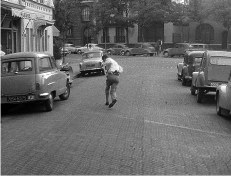
Figure 3. Jean-Paul Belmondo as Michel Poiccard straggling to his death in Breathless .