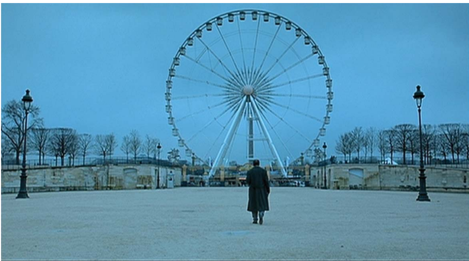
Figure 7. Miao Tien at the Tuileries Gardens, Paris, Tsai Ming-liang, What Time is it There?

Jean-Pierre Léaud’s cameo in the Montmartre cemetery parallels Miao Tien’s spectral appearance in the Tuileries Gardens. The particular cemetery is significant because it is where Truffaut lies in rest, thus rendering the spiritual father of both Léaud and Tsai absent presences in the scene, for savvy viewers. Setting the cameo in a cemetery suggests Léaud’s lack of vitality. Full of life as the energetic Antoine in The 400 Blows , Léaud became a bit of a ‘washout’ in his later career. 13 Echoing the reincarnation of Doinel in Hsiao-kang in The 400 Blows ’ gravitron sequence, which the latter watches (Bloom 2005, 319), Léaud also makes a cameo appearance as a semblance of ‘himself’, 40 years older