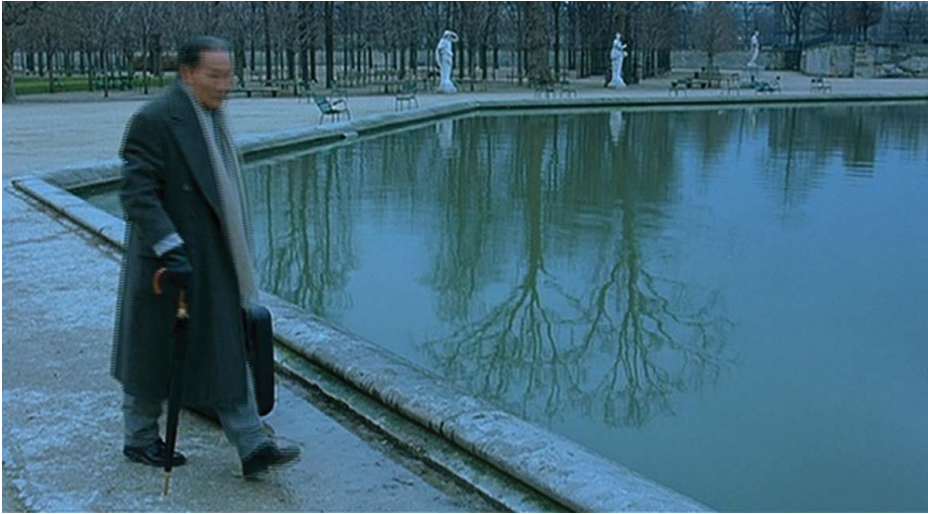
Figure 6. Miao Tien at the Tuileries Gardens, Paris, Tsai Ming-liang, What Time is it There?

aptly calls a ‘self-reflexive desire to “turn back time” in order to re-inhabit the lost moment of the nouvelle vague ’ (see also Neupert 2007, xxix).