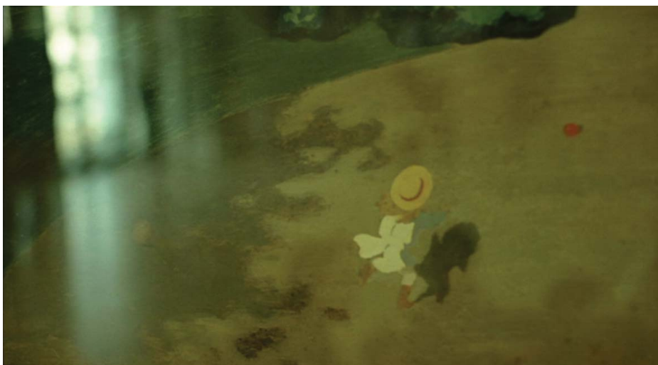
Figure 11. Detail of Félix Vallotton's painting The Ball at the Musée d'Orsay in Flight of the Red Balloon .

Simon identifies it as a 'high angle shot'. Through the mouthpiece of this precocious student, Hou borrows cinematic terms to discuss painting, showing the overlap between the two modes of representation, which mirrors the cross-fertilization of cultures in this film.