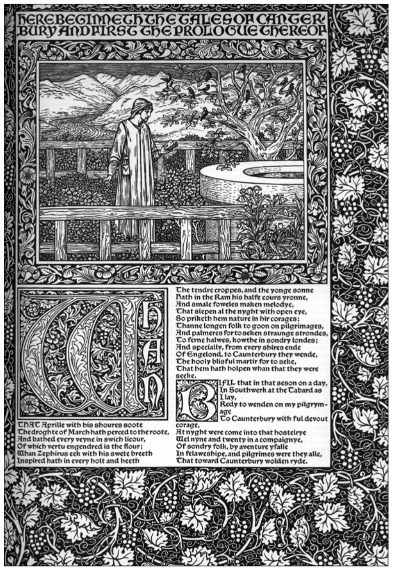
Fig I Kelmscott Chaucer (1896). From Works. A Facsimile Edition of the William Morris Kelmscott Chaucer. Cleveland: World Publishing, 1958.

the work was finished (Figure 1). Thirteen additional copies printed on vellum sold for the even more exorbitant price of 120 guineas (approximately £125). The "paradox of price" has been a longstanding puzzle for critics interested in the social implications of