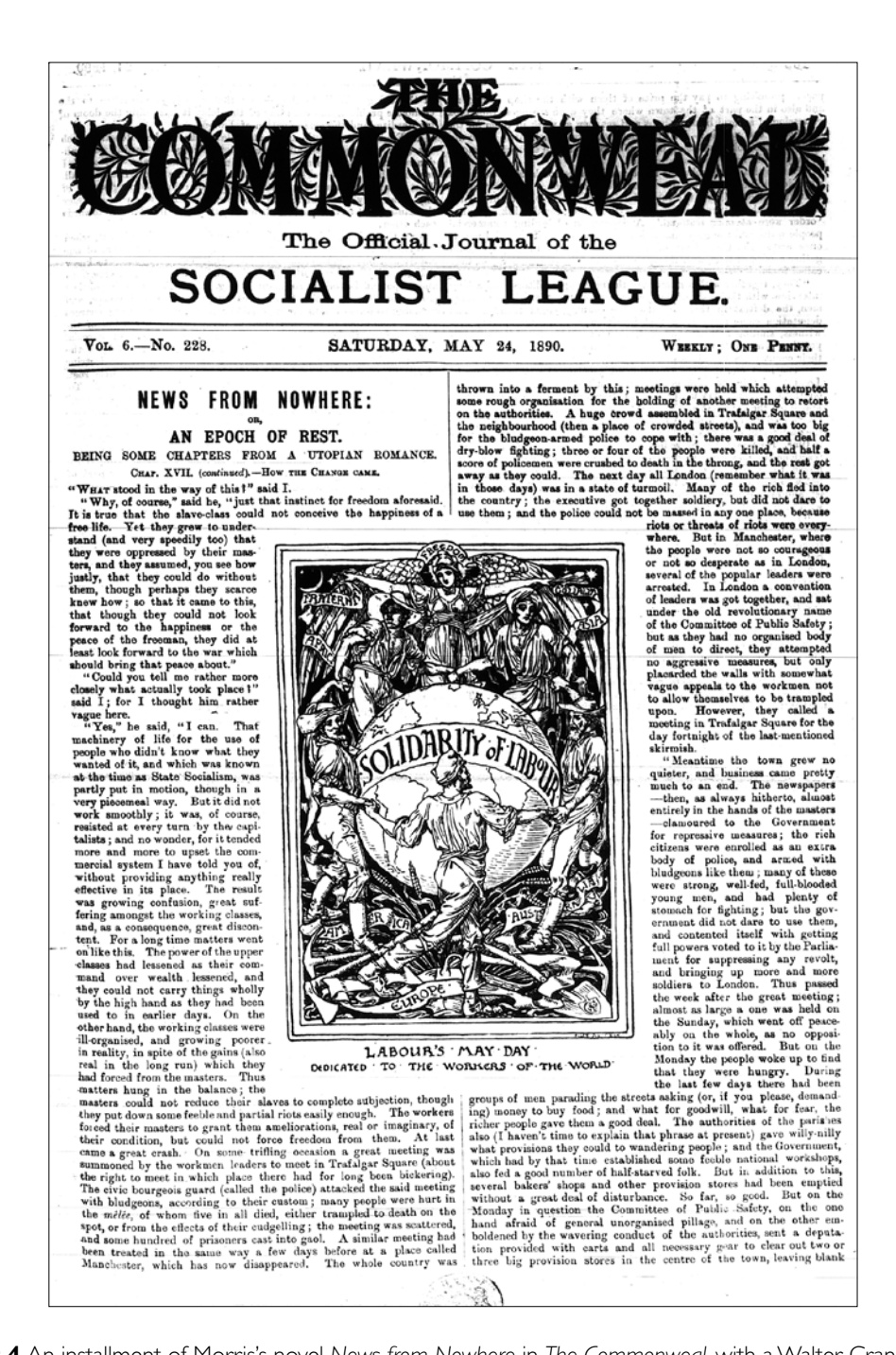
Fig 4 An installment of Morris's novel News from Nowhere in The Commonweal, with a Walter Crane cartoon embedded in the text (May 24, 1890). Labadie Collection, University of Michigan.

The Journal of Modern Craft Volume 4—Issue 1—March 2011, pp. 7–26