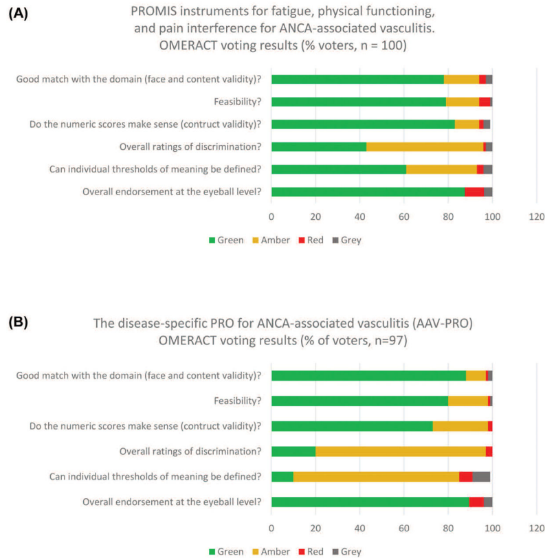
Figure 3. OMERACT endorsement of PRO in AAV. (A) PROMIS instruments for fatigue, physical functioning, and pain interference for AAV voting results. (B) The disease-specific AAV-PRO voting results. OMERACT endorsement set at 70% of votes (sum of Green or Amber). Green (OK): Yes, I agree; Amber (OK): I am okay with this, but have some reservations, more work needed in this area; Red (Not OK): I disagree; Grey: Insufficient evidence or information. OMERACT: Outcome Measures in Rheumatology; PRO: patient-reported outcomes; ANCA: antineutrophil cytoplasmic antibody; AAV: ANCA-associated vasculitis; PROMIS: Patient-Reported Outcomes Measurement Information System; AAV-PRO: PRO measure for AAV.