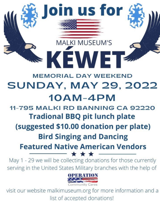
Figure 13 : Advertisement for the Morongo fiesta, know as the Kewét, for 2022. Malki Museum , www.malkimuseum.org/kewet

California Native fiestas still exist, their character differs from the grand Native fiestas of pre-invasion and colonial times throughout Southern California history. Nevertheless, present fiestas continue to stand as testaments of Southern California Native survival, adaptability, and Native-centered promotion of traditional Southern California culture.