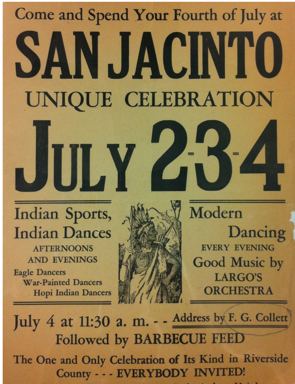
Figure 12 : San Jacinto (Soboba) fiesta poster for July 2-4, c. 1932. Along with the event being held for a U.S. holiday, the poster advertises a stereotypical image of a Native American likely for the purpose of appealing the event to a non-Native audience. National Archives and Records Administration, Perris, California.