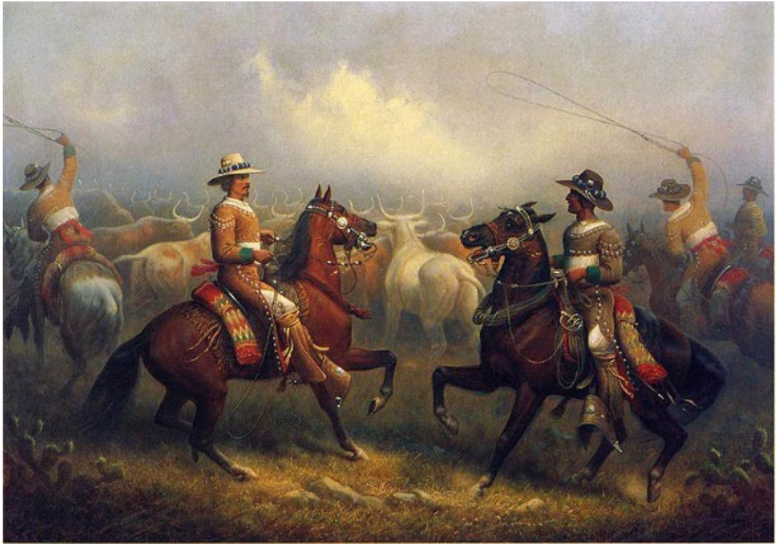
Figure 8: Typical dress for Californio Vaqueros. California Vaqueros, by James Walker, 1875, American Museum of Western Art - the Anschutz Collection - Denver, Colorado.

and instead allowed them to grow at their longest, “washing and grooming them for fiesta occasions,” which further added to an impressionable sight. 227