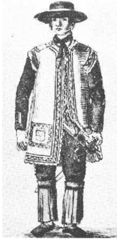
Figure 5 : Earliest known images of Hispanic couple in California, 1791, by Jose Cordero. Museo Naval , Madrid.

best vaqueros not only throughout California, but throughout the Spanish Empire. 201 Likely, Native cultural traditions of appreciation and respect for wildlife for millennia contributed to their superior abilities in the care and taming of horses. According to Doña Eulalia Perez, some rode bareback while others rode in saddle. 202 For bareback riders, typical clothing consisted of nothing more than their shirt and a blanket and loincloth, whereas saddled riders were provided with a shirt, vest, pants, a hat, boots, shoes, spurs,