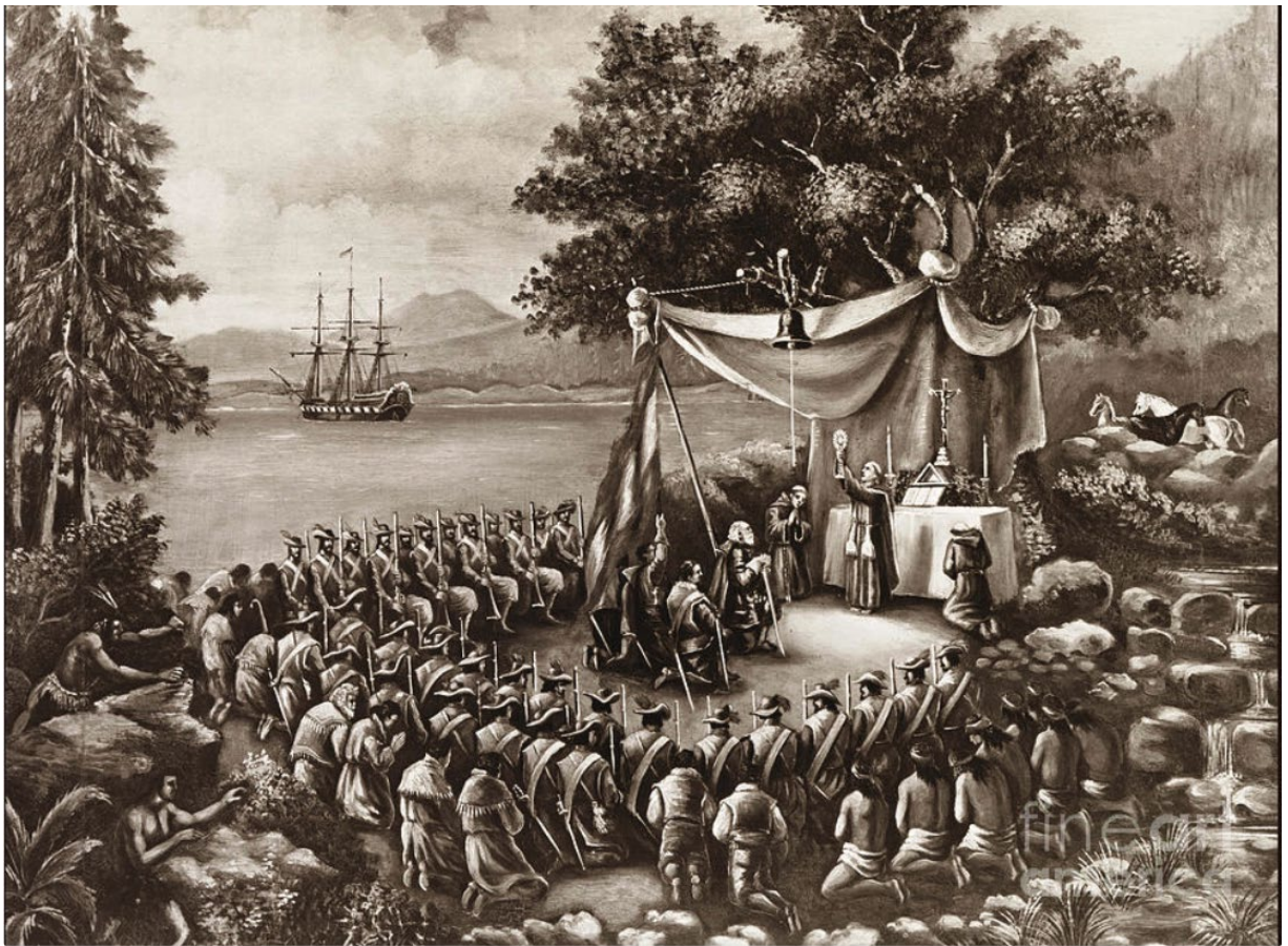
Figure 1 : Father Serra's Landing Place or Celebration of the First Mass . Painting by Léon Trousset, circa 1877. The painting depicts Father Serra at the altar surrounded by members of the Gaspar de Portola Expedition. Illustrated in the foreground, Native neophytes are participating in the ceremony, while others watch from the forest. Original held by California Historical Society .