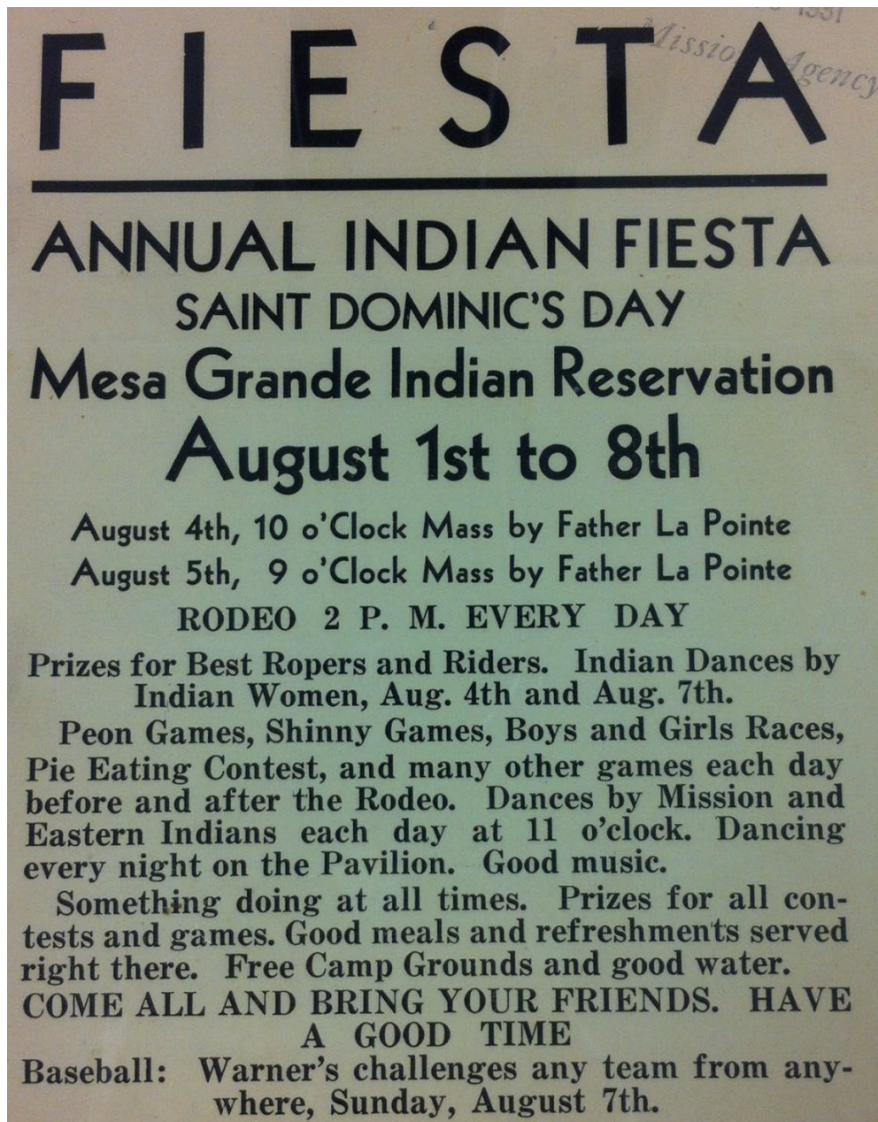
Figure 11 : Mesa Grande fiesta poster for August 1-8, 1931. Depicted are a variety of Native and non-Native events geared at attracting a varied crowd. National Archives and Records Administration, Perris, California.