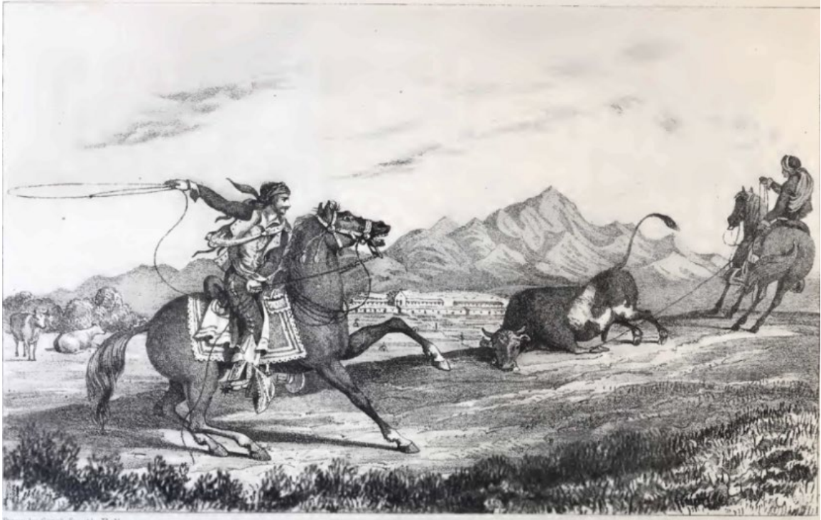
Figure 6 : Illustration of a saddled rider, 1839. From California: A History by J. Forbes.