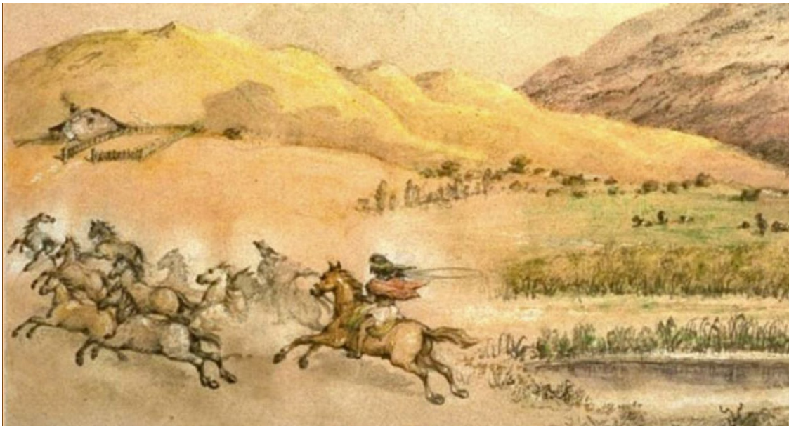
Figure 7 : Illustration of a bareback rider, Southern California, Temecula. Sketched in 1871 by Edward Vischer.