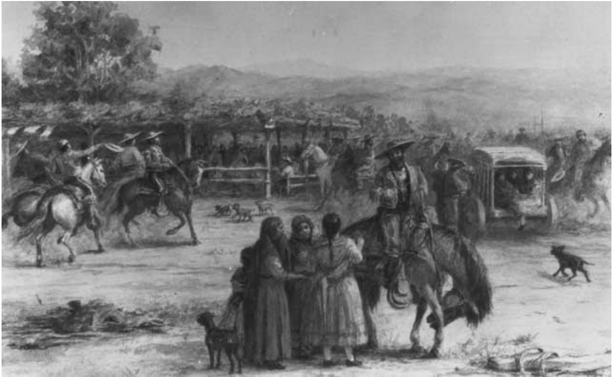
Figure 4 : Fiesta scene by Alexander F. Harmer. Circa 1885. Seaver Center .

they also “dressed and tanned sheep and calf skins for clothing; they wove blankets; they made wine; they raised grain enough for their bread.” 197 Typically, domestic skills were taught by a Native neophyte or by a European settler, as recalled by Doña Eulalia Perez: “In each of the different work areas there was a teacher who was a Christian Indian. This person had received some formal instruction. A white man was in charge of the looms, but he stepped down once the Indians finally learned the skill.” 198 Some of these skills also included the manufacture of clothing. The extravagant fabrics and material culture of fiestas throughout the Californio Period rested on the domestic labor of Native women.