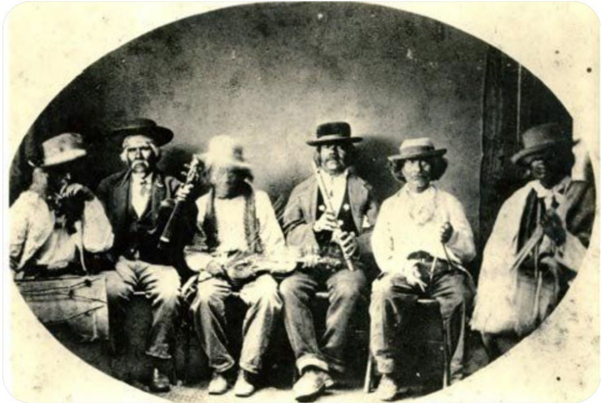
Figure 2 : Last Native choir and band of Mission San Buenaventura, circa 1873.

Spanish fiesta production throughout the Mission Period occurred frequently. Charles Nordhoff, a regular visitor to California throughout the nineteenth century, remarked on mission fiestas and their frequency, specifically at Mission San Luis Rey. According to Nordhoff, San Luis Rey “made place and occasion for frequent festivity,” and to the mission “came families from fifty miles around, with their retainers, for a fiesta.” 88 Nordhoff also mentioned that often fiesta attendees remained at the fiesta for “a