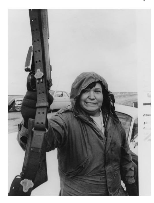
FIG. 4. Unidentified Indigenous woman with gun at Wounded Knee.