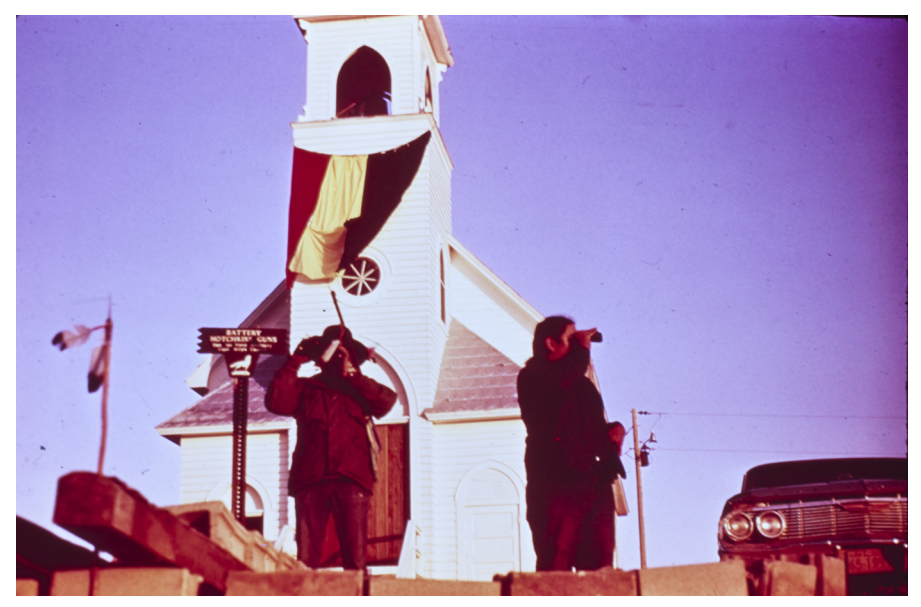
FIG. 3. Two male occupiers in front of at the hilltop Wounded Knee church with rifle and binoculars. From the church tower flies AIM's national flag. Left of the church is a signpost indicating the position of the Hotchkiss gun battery during the 1890 massacre. Both the declaration of the Independent Oglala Nation and the setup of the AIM warrior society went hand in hand.