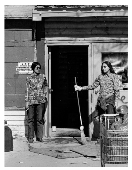
FIG. 5. Two Indigenous women in front of the Wounded Knee Trading Post.

Some of the guys thought that that was not a cool thing. They weren't crazy about it. But there wasn't much resistance to it [either]. Everybody just sort of said: "Come on out and join," and so ... one of the bunkers ... was predominantly staffed by women.... [T]hey started taking positions and roles in the leadership of the security, and they were always in the negotiations that were held up in what we called the DMZ zone.<sup>125</sup>