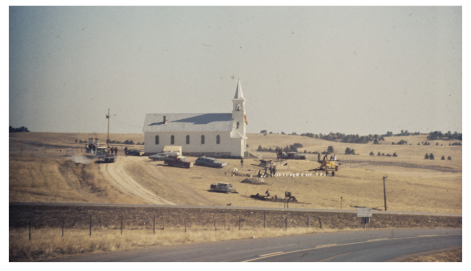
FIG. 1. Wounded Knee with hilltop church and cemetery (to the left of the church) with arch entryway. The photo shows activists bulldozing ground, erecting bunkers and fortifications, and flying the AIM flag from the church tower. The Wounded Knee cemetery contains a mass grave with the remains of those killed in the 1890 massacre, a monument, as well as the graves of many Lakota war veterans from World War I, World War II, Korea, and Vietnam.

On December 29, 1890, Wounded Knee, South Dakota had gained nationwide notoriety as the site of an infamous massacre committed against 250 to 300 Lakota men, women, and children by the US Cavalry.<sup>26</sup> By the 1970s the tragic incident was wellknown to Indigenous activists, to whom the locality of Wounded Knee contained a powerful, multilayered symbolism related to the violent demise of the Ghost Dance, a spiritual revitalization movement, and the massacre itself. It also came to symbolize economic and cultural exploitation by the owners of the Wounded Knee Trading Post.<sup>27</sup> At the same time, the very place that represented the destruction of a people's way of life was also a site where political sovereignty and cultural identity could be restored and reaffirmed and where the United States government could be compelled to reexamine the 1868 treaty, as in Indigenous nationalist movements elsewhere.<sup>28</sup>