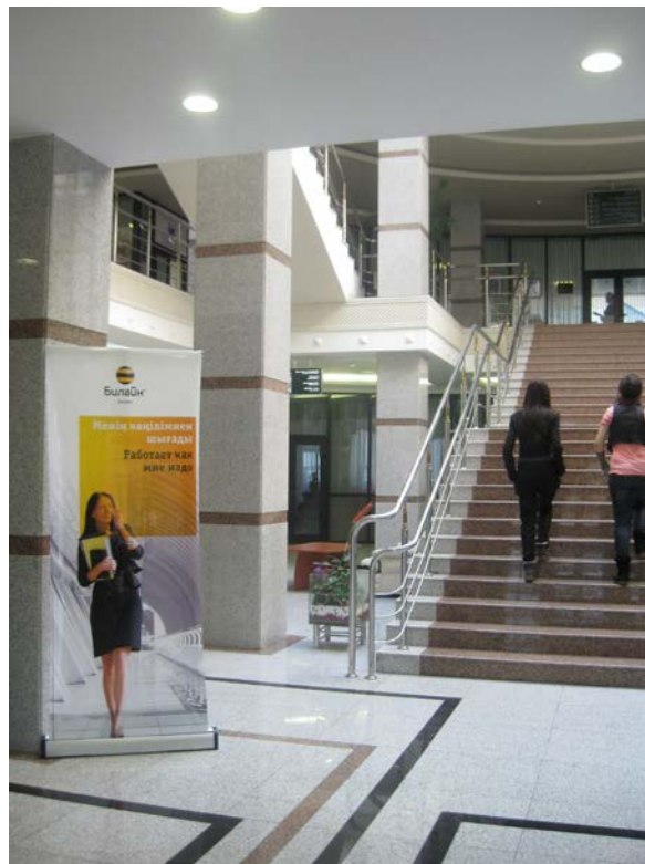
Figure 1. Posters advertise the Beeline cell phone company in the lobby of the National Academic Library of the Republic of Kazakhstan.

In this article, we use this introduction to the National Academic Library of the Republic of Kazakhstan (hereafter, NAL ), alongside librarian surveys, interviews, and ethnographic observations, to uncover librarians' experiences in entering the profession, working within reference and public service departments, and understanding their library's role in a wider post-Soviet