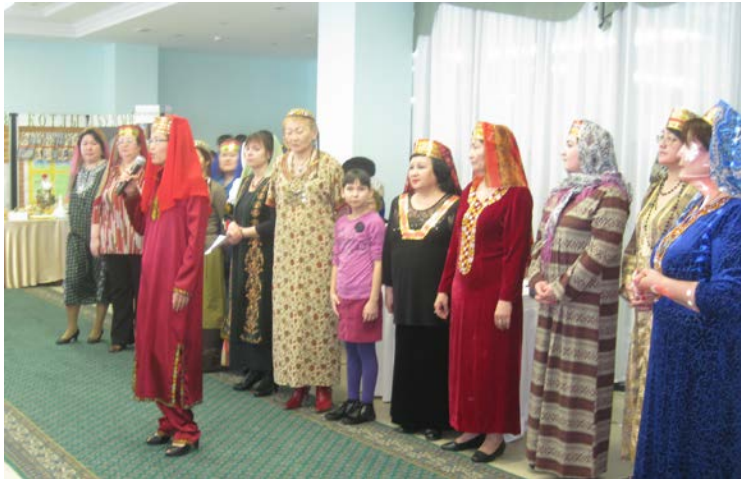
Figure 3. Kazakhstani librarians participate in a cultural exchange during a Nauruz celebration at the National Academic Library.

newly-constructed capital cities, Astana was built in a defensible location 57 , as part of a larger nation-building project to solidify Kazakhstan's unity and independence. 58 In a city designed as a "showpiece of Kazakh culture and identity" 59 , the National Academic Library hosts singers, artists, and scholars as well as celebrations of national festivals such as the spring Nauruz holiday, celebrations which serve to reinforce Kazakhstan's ethnic heritage and intercultural unity through the venue of food and clothing (see Figure 3).