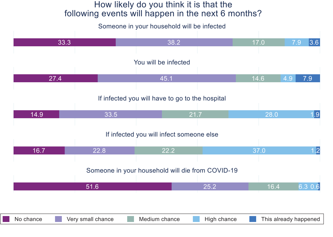
Fig 2 | Perception of future risk and/or complication from a COVID-19 infection among survey participants between December 29, 2020 and April 2, 2021 within a Federally Qualified Health Center in San Ysidro ( n = 179).

the start of the pandemic, and shortly after vaccines started to become available.