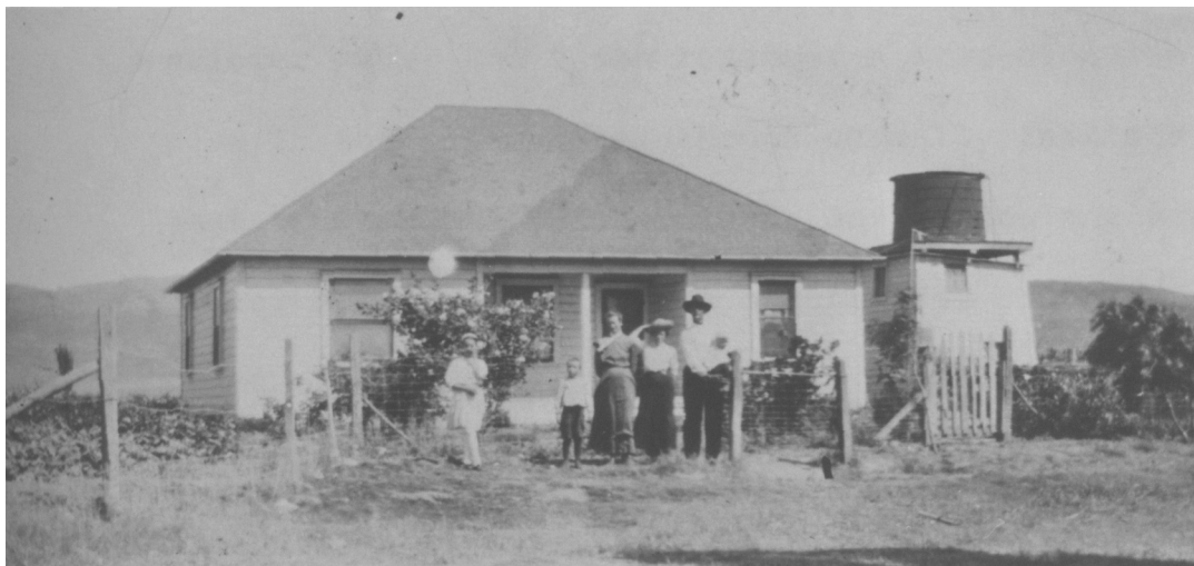
The McHenry Farm, Lompoc, California, 1912