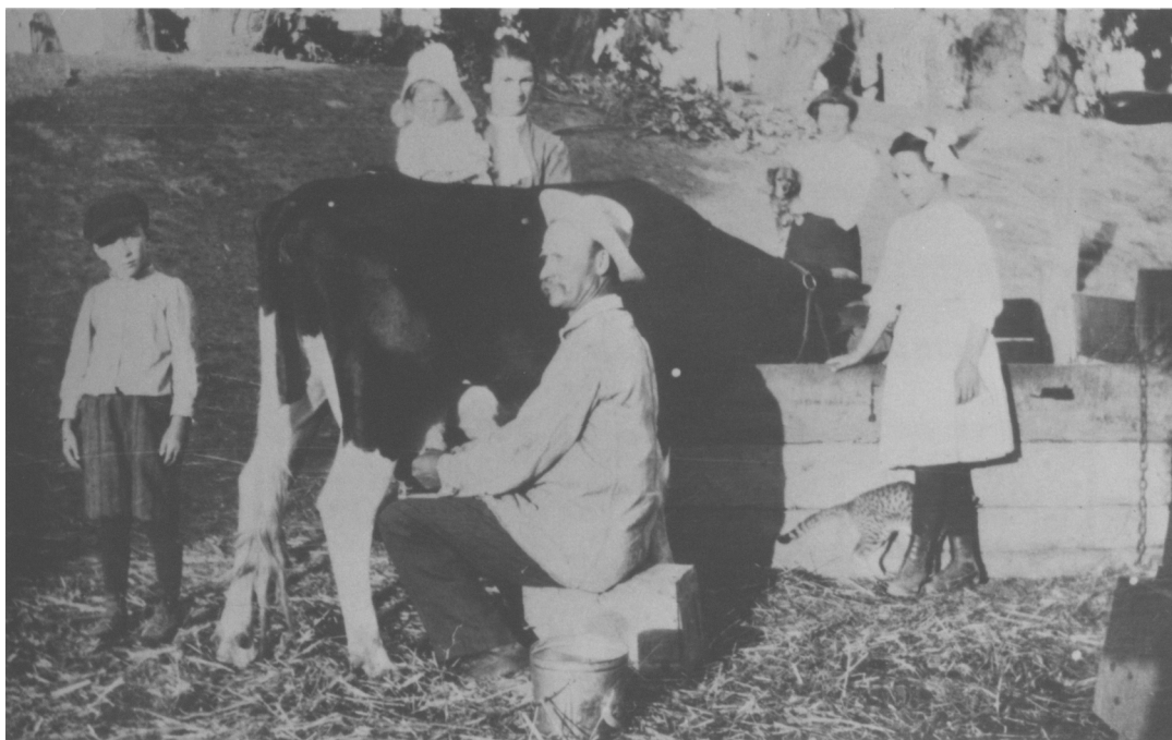
The McHenry Farm, Lompoc, California, 1912