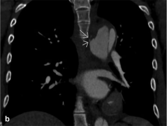
Fig. 3 CT angiography—(a) axial and (b) coronal—images of region suspicious for contrast extravasation (arrows) along proximal descending aortic arch dissection.