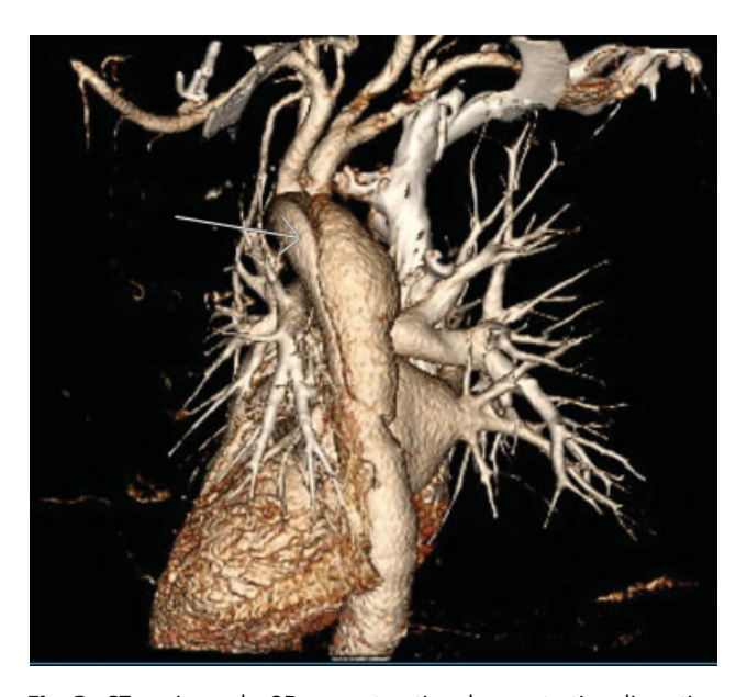
Fig. 2 CT angiography 3D reconstruction demonstrating dissection of distal aortic arch/proximal descending aorta (arrow) originating just distal to subclavian artery take-off.

was 100 mL and one unit of packed red blood cells was given.