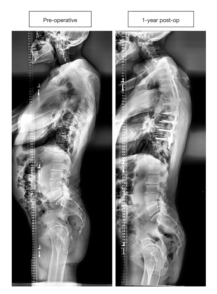
Figure 3 Case example of a 50-year-old male CD patient who underwent an 11-level posterior fusion, which was estimated at $55,205. This patient did not require a re-operation for any complication. CD, cervical deformity.

Journal of Spine Surgery, Vol 4, No 4 December 2018