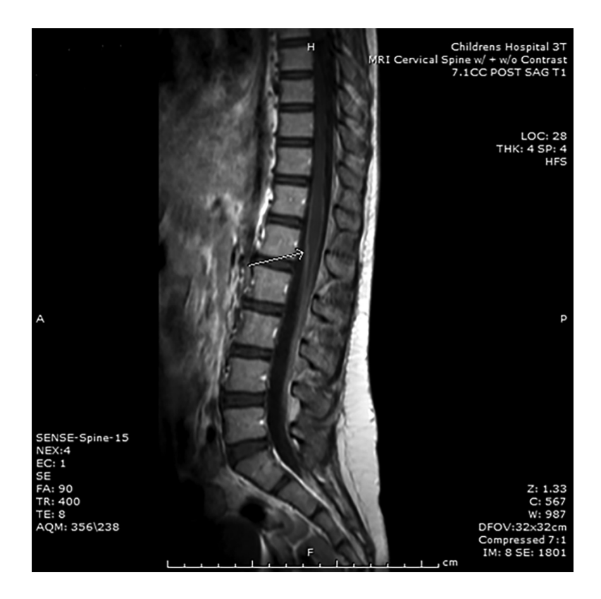
Figure 1. Contrast-enhanced T1-weighted magnetic resonance imaging of the lumbar spine from the case patient. Smooth and linear leptomeningeal enhancement is observed along the margins of the conus medullaris (arrow) and involves the cauda equina without underlying signal abnormality of the spinal cord or vertebral bodies.

returned to Mexico to continue her anti-TB therapy with INH and rifampin alone.