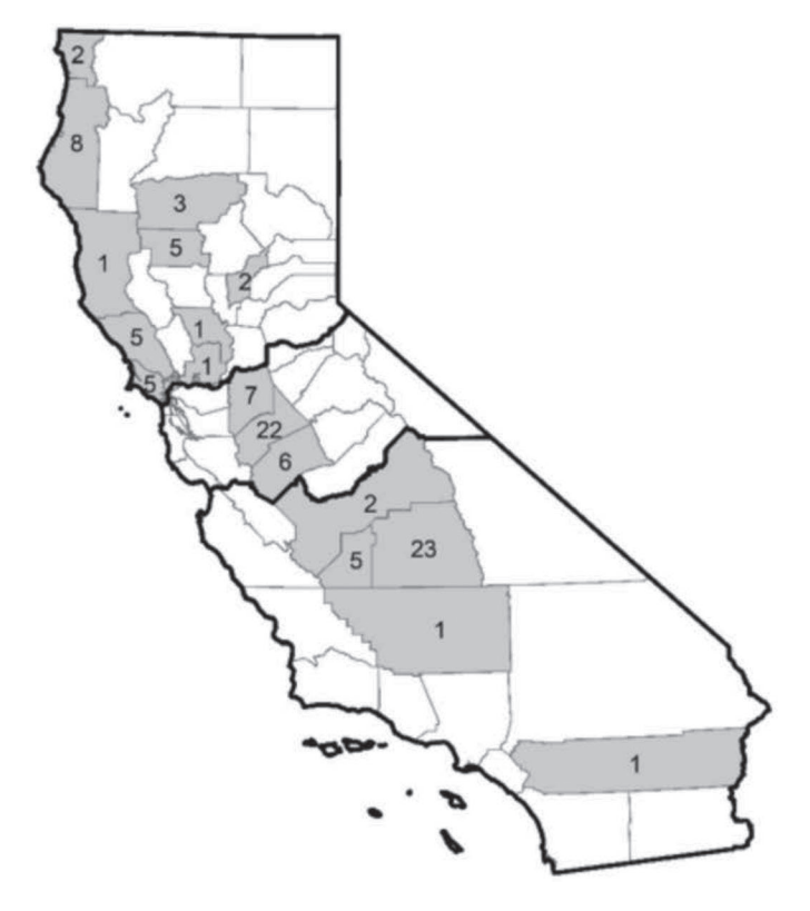
Figure 2. Map of counties in northern California (top section), northern San Joaquin Valley (middle section), and greater southern California (bottom section). Shaded areas contain counties and number of dairies per county sampled for a study of 100 California dairies surveyed between May 2014 and April 2016 relating management practices to bovine respiratory disease prevalence.

including supplementation with a colostrum replacer, heat-treatment, bacterial content testing amount or type of bacteria before or after heat treatment), storage for greater than 2 h between milking and feeding calves, and use of a preservative. Colostrum source was categorized as 100% individual cow or nursing from dam (R), 100% pooled from multiple cows, or a mix of those sources including colostrum replacer. Colostrum from individual cows and colostrum nursed from the dam were combined into a single category because the quality of the colostrum from these sources was regarded as equal. For those dairies that heat-treated their colostrum, the time between colostrum harvest and heat-treatment was categorized into either less than (R) or more than 6 h. The distribution of storage time for colostrum before feeding in hours underwent a square root transformation to achieve normality. If colostrum was stored for less than 2 h, zero hours were recorded for colostrum storage time. Storage temperature for colostrum was recorded as either room temperature (R), refrigerated, frozen, or first