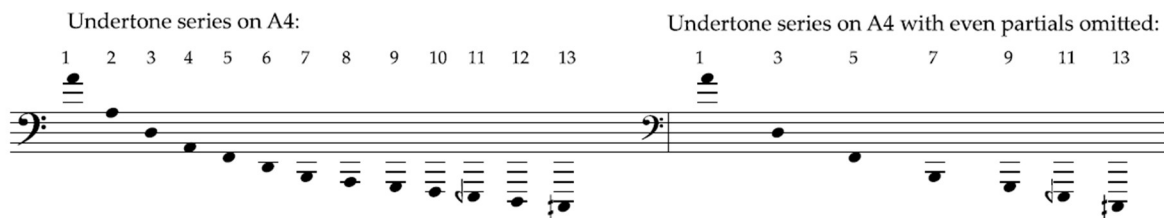
Figure 4: Undertone series of A4

526-530: D (3 rd partial); mm. 531-536: F (5 th partial); mm. 537-542: B (7 th partial); mm. 543-550: G (9 th partial); mm. 551-560: E-quarter-flat (11 th partial); mm. 561-572: C-quarter-sharp (13 th partial). These pitches are both increasingly distantly related to the A pedal – i.e., further along the undertone series – and they are increasingly lower in pitch. 30 Figure 4 shows the derivation of these roots: the figure first shows all undertones of A4 up to the 13 th , then shows only the odd-numbered undertones, which are the roots described above.