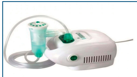
AeroEclipse® II (Monaghan Medical Corporation, Plattsburgh, NY)