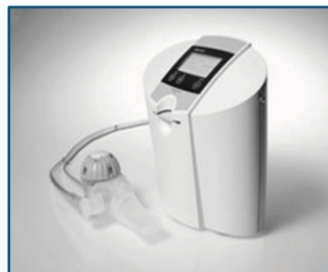
Figure 2 Examples of novel marketed nebulizers. Examples of the different types of commercially available nebulizers that incorporate newer aerosol generating technologies. PARI LC® Sprint (PARI, USA 83 ); SideStream Plus® (Philips, USA 84 ); AeroEclipse® II (Monaghan Medical Corporation, USA 85 ); Micro Air® NE-U22 (Omron Healthcare, USA 86 ); AKITA2® APIXNEB (PARI Pharma GmbH, Germany 87 ).

(FEV 1 ) when compared with placebo. 44,45 No significant differences were observed between these two treatments in terms of efficacy, cost, occurrence of AEs, or hospitalizations. 46 With regard to nebulized SAMAs, nebulized ipratropium demonstrated significant improvements in FEV 1 within 15–30 minutes, which persisted for 4–5 hours. 47 Furthermore, clinical studies of dual ipratropium-albuterol have demonstrated improvements in FEV 1 versus both albuterol or ipratropium alone. Ipratropium-