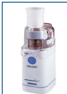
Micro Air® NE-U22 (Omron Healthcare, Bannockburn, IL)