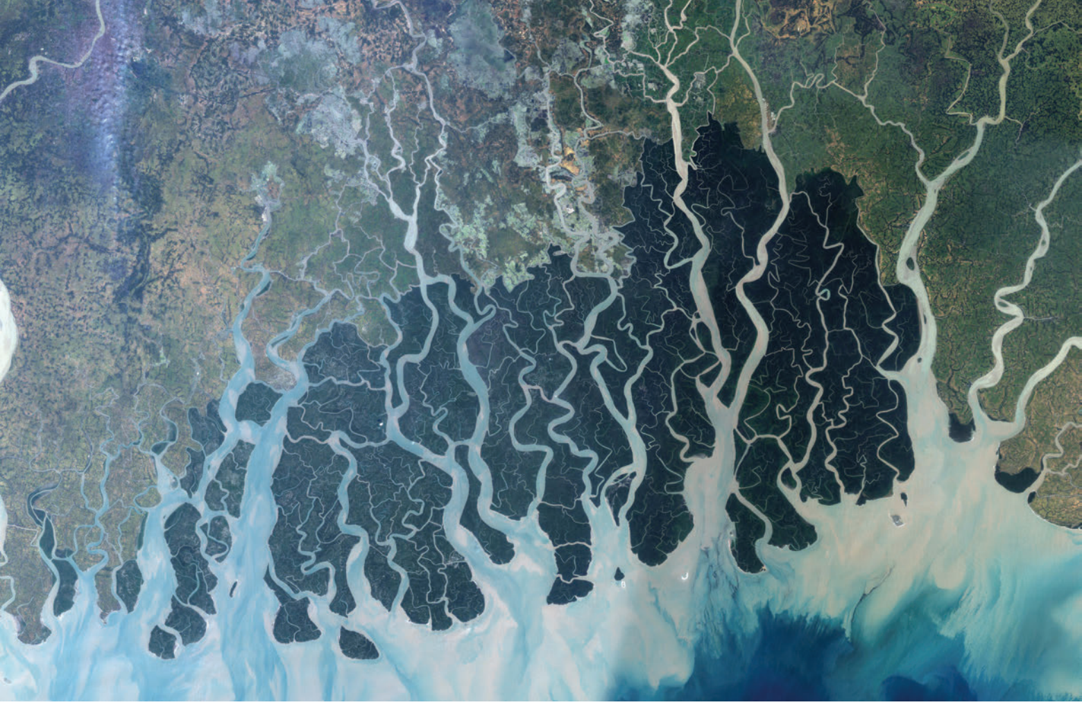
FIGURE 2. Landsat 7 Image of the Sundarbans, released by NASA Earth Observatory.

throughout the city (fig. 1). Referencing the catastrophic 2004 "Boxing Day" Tsunami, which killed 230,000 and displaced as many as 1.75 million people across the Pacific Rim, the signs suggested a way of reading the Sundarbans beyond its status as a "natural wonder" and World Heritage site alone. Here, the Sundarbans were framed not only as a site deserving of saving as a public and environmental good in the present. The mangroves also were positioned as critical ecological infrastructure—a space providing security for urban life in coastal South Asia itself. In other words, the mangrove forest was a vital system protecting the future of urban South Asia. As such, it was in urgent need of management through a variety of "political technologies of preparedness" (see Lakoff and Collier 2010).