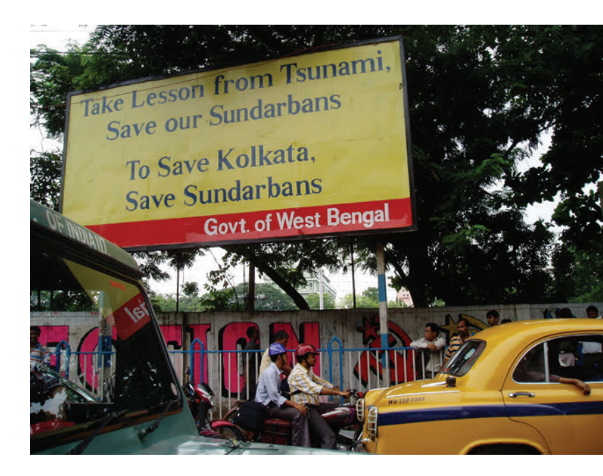
FIGURE 1. Billboard in Kolkata, 2005.

In 2005, while living in Kolkata, India, I began to notice a series of signs and billboards appearing