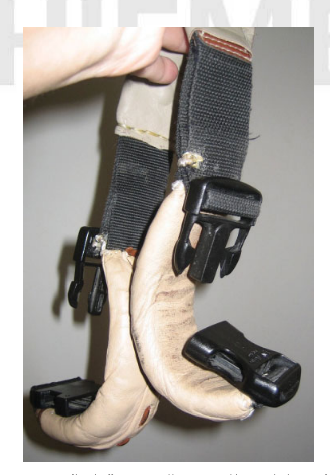
Fig. 3 A set of handcuffs constructed by a 65-year-old man with a history of dream enactment episodes to prevent himself from moving and hurting himself and his wife. The nocturnal episodes became extremely dangerous in the last few months before presentation to the UCLA Sleep Disorders Center.

One recent study from Spain demonstrates a "dose response" relationship between the onset of RBD to the development of a neurodegenerative syndrome, where the time of iRBD diagnosis to neurodegenerative disorder