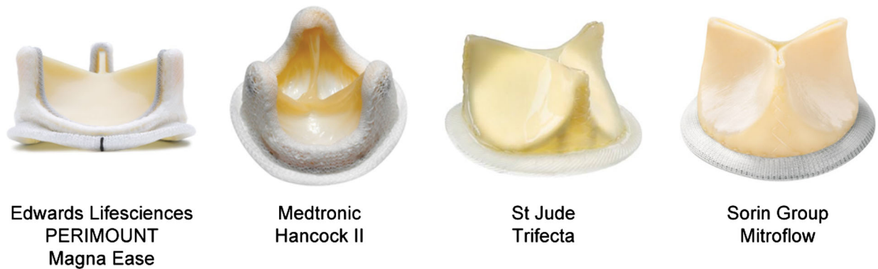
FIGURE 3. A composite of bioprosthetic valves from each of the four major manufacturers.

offer excellent hemodynamics and durability. 54 This line consists of the PERIMOUNT™ Magna Ease Aortic Valve, Magna Aortic Valve, Standard Aortic Valve and Theon Aortic Valve. Additional aortic valves offered by Edwards are the Carpentier-Edwards Aortic Porcine, S.A.V. Aortic Porcine and the Edwards Prima Plus Stentless Bioprosthesis. Bovine pericardial valves from Edwards are treated with their ThermaFix process, which is a dual-action treatment aimed at reducing the potential calcium binding sites to improve long term valve performance. 74 Porcine aortic valves produced by Edwards are treated with the patented Xenologix treatment which has shown to result in low rates of calcification. 22 The bovine pericardial Carpentier-Edwards PERIMOUNT™, which is the second generation line of valves, show excellent durability compared to the first generation pericardial valves (Fig. 3). 54 Structural valve deterioration in elderly patients, occurs at low enough rate to result in an extremely low rate of reoperation. 54 The Prima Plus Stentless Porcine Bioprosthesis is a biograft, a bioprosthesis plus homograft that has exhibited excellent long-term outcomes and maintains optimal hemodynamics. 22,42