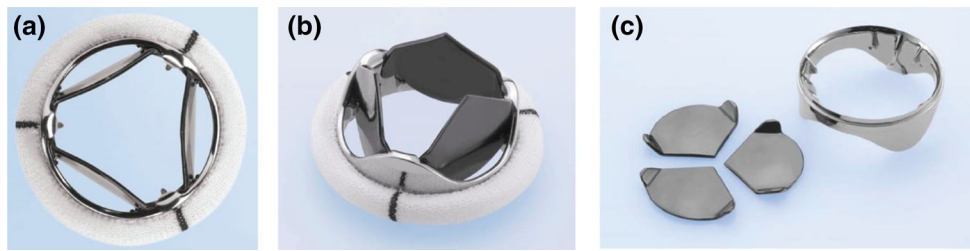
FIGURE 2. A trileaflet mechanical heart valve provides flow characteristics that more closely mimic native aortic valves. The valve contains a pivot mechanism that allows airfoil-like leaflets to close before flow reverses, a phenomenon that also occurs in the body. (a) Valve from above in fully open position. (b) Elevated isometric view of the valve in a fully open position. (c) Disassembled valve with three pyrolytic carbon leaflets and ring.

Pre-clinical valve optimization is difficult due to the complex flow across the valve that includes areas of high velocity and viscous shearing, which may in turn cause platelet activation and hemolysis. This is contrasted with areas of the valve that promote thrombus formation due to low flow velocities and resultant increased residence times. An additional manner through which to reduce thrombus formation is the development of surface coatings that resist platelet activation. One relatively new technique utilizes a polymerization process that uses horseradish peroxidase (HRP) as a catalyst to make hydrophilic polymers needed for a non-adhesive outer coating. 8 Biocompatible flow chambers used to simulate the ex vivo performance and response of mechanical and bioprosthetic valves may also prove to be a significant development; however, they have yet to be fully optimized. 91