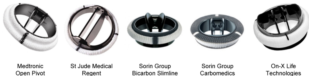
FIGURE 1. Composite image of examples of mechanical valves from the major manufactures.

The aortic line of Medtronic mechanical valves consists of the Open Pivot valves, which include the Open Pivot standard aortic valve and Open Pivot AP both of which are also available for implantation in the mitral position. Medtronic also offers the Open Pivot AP360 which is solely for use in the aortic position. AP360 provides a supra-annular flanged cuff for added flexibility and conformability in addition to the fea-