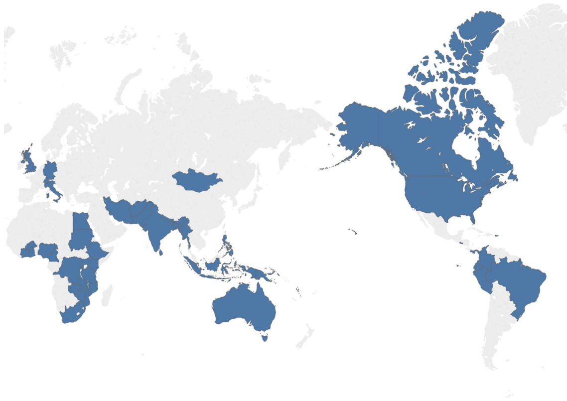
Fig. 3 Countries represented at the first, second and third GICS meetings

Vellore, India, in January 2018 where 110 participants (two-thirds from LMICs) representing 33 countries were in attendance. The effort to promote LMIC leadership is replicated at every level of the GICS organization with 50% of the Board of Directors being from LMICs and all working groups being led by providers from LMICs.