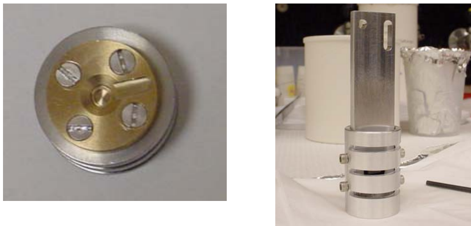
Figure 3. Sample holders used to perform the RIXS measurements of in-situ uranium(VI) adsorption on thin iron films, Np sorption on iron coupons, and amorphous \text{NpO}_2 at BL-7.0 of the ALS. The liquid cell shown on the left (without the silicon nitride window) was utilized for in-situ U studies, whereas the assembly on the right was used for the Np investigations. The diameters of the transferable puck and the slotted can are both 25.4 mm.