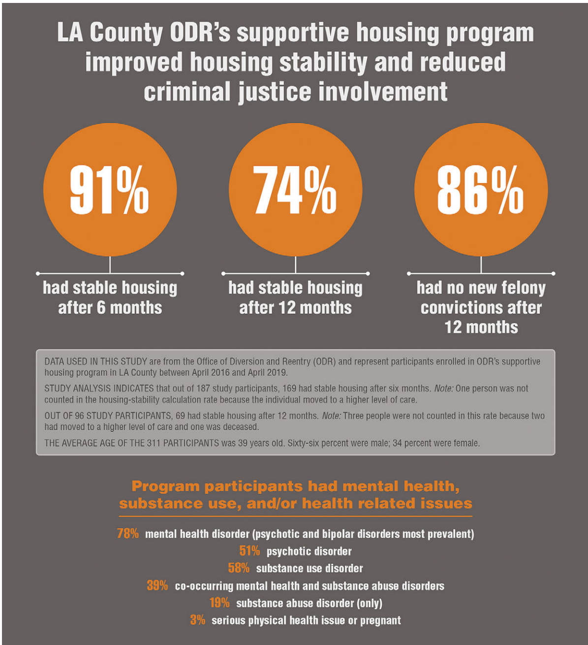
FIGURE 2. Preliminary data on ODR’s permanent supportive housing program. 6

services. The majority of pregnant women served by ODR reside in specialized interim housing settings that allow women to remain with their children until they are moved to permanent supportive housing.