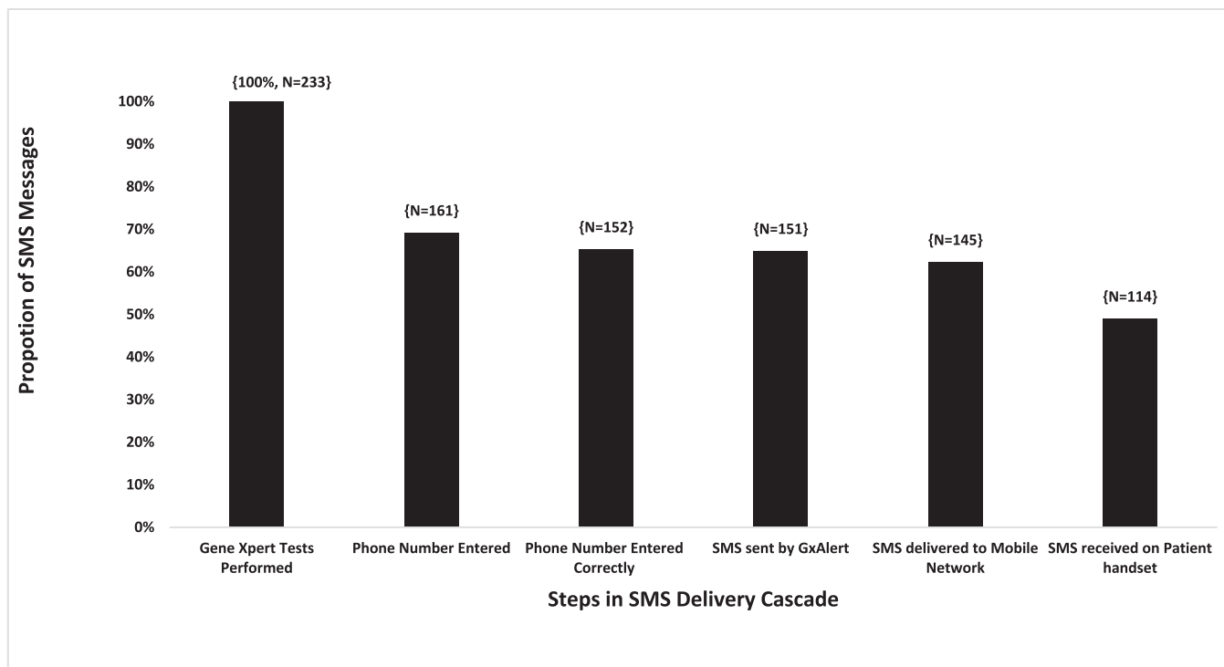
Fig. 1. Patient SMS delivery cascade for Xpert MTB/RIF results.