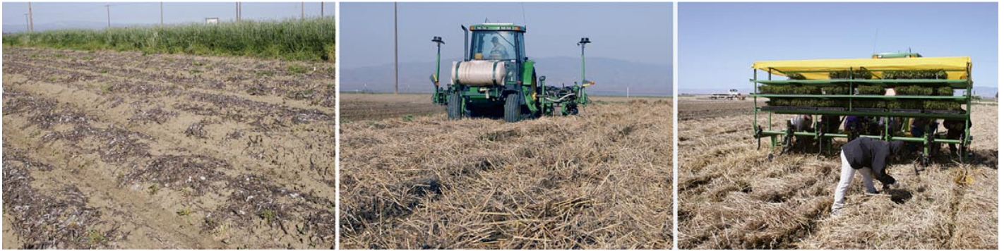
Cover crops in conjunction with conservation tillage helped to maintain soil fertility. Left , cotton and tomato crop residues prior to no-till transplanting; center and right , no-till cotton planting with a John Deere 1730 no-till transplanter directly into a cover crop of triticale-winter rye-vetch.

nitrogen were more variable. The CTCC and STNO treatments had much higher total soil nitrogen values than expected; STCC had a slightly larger value, while CTNO had a much larger loss than expected. Nitrogen is generally much harder to budget than carbon. The differences between the budgeted and actual values for the two cover-crop treatments suggest that the actual nitrogen fixation rate of the cover crop was larger than we estimated. The largest difference between expected and actual total soil nitrogen was in the STNO treatment, where we expected a total nitrogen loss and instead we saw an increase of 535 pounds nitrogen per acre. This difference is difficult to explain. The nitrogen budget does not account for nitrogen losses due to leaching or denitrification; these two processes may account