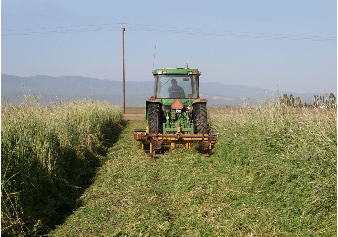
One challenge of growing cover crops with conservation tillage is managing the residue to avoid complications with furrow irrigation.

systems have the potential to accumulate organic matter in some geographic regions. In other regions, conservation tillage redistributes organic matter to the soil surface while decreasing organic matter in the subsurface, depending on soil type and climate.