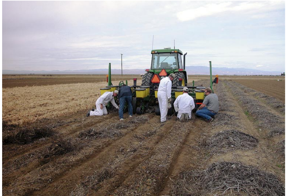
In this study, some soil parameters improved with conservation tillage, while others declined. For example, after 4 years of conservation tillage without a cover crop, soil salinity increased significantly. Above, researchers evaluate no-till planting into tomato residues.

In other parts of the United States, conservation tillage and cover cropping have been shown to improve soil quality. In our study, after 4 years of conservation tillage the soil's physical properties improved, but its fertility degraded somewhat. Bulk density and penetration resistance were lower in the conservation tillage systems; these soil properties improve water infiltration and conservation, and improve rooting depth. Conservation tillage increased available phosphorus but redistributed potassium from the subsurface to the surface by accumulating organic matter at the soil surface and not remixing it with tillage. Nitrate accumulated at the surface as well. By concentrating these