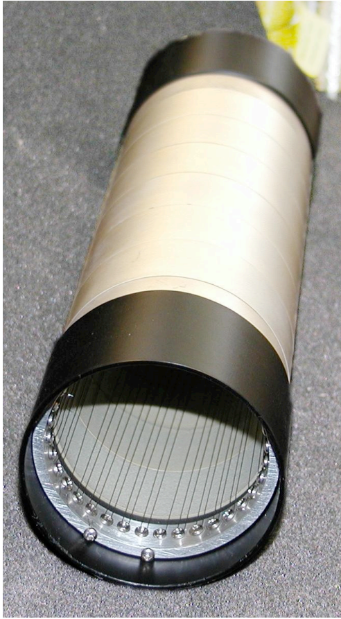
Fig. 2: Photograph of the 20 cm ferroelectric plasma source showing the aluminium mounting rings and the stainless steel electrode wires.