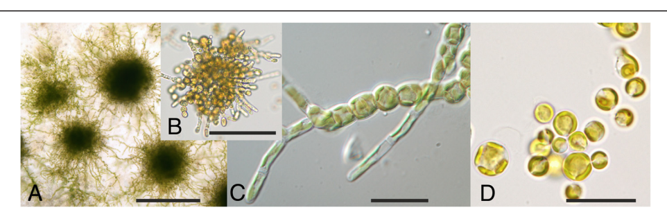
Figure 1 Morphology of three strains of Heterococcus viridis in culture. (A) Prostrate colonies produced by branched filaments on the surface of an agarized culture, 16 weeks old (strain B10). (B) Enlarged view of a young (4 weeks old) colony, liquid culture, strain SAG 835–7. (C) Enlarged filament, 6 week old agarized culture (strain MZ3-7). (D) Coccoid cells in a 4 weeks old liquid culture (strain SAG 835–7). Scale bar in (A) 500 µm, in (B) – (D) 20 µm.

Four of the strains, identified as Heterococcus , were green algae (Figure 2). These were not included in the rest of the study. The rbc L gene sequences were used to assess the phylogenetic relationships of the remaining 29 strains (Figure 3, Additional file 1). For 25 strains, PCR amplification was successful for the whole region from psb A (downstream), through the rbc L, through the rbc L/