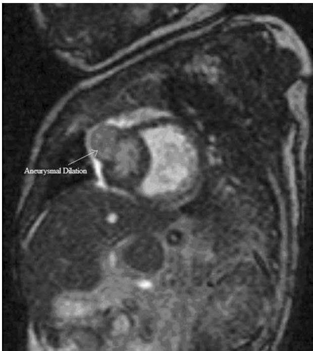
Fig. 3 Short-axis magnetic resonance image that demonstrates an aneurysmal dilation in the RV

the tricuspid valve was noted to have begun functioning with forward flow into the RV. The RV pressure continued to decrease to less than one-half systemic. The pressures in the left ventricle (LV) and aorta equalized. Because occlusion of the PDA resulted in inadequate pulmonary blood flow, a 4-mm central shunt of reinforced Gore-Tex was placed. Using a Doppler probe, it was found that on occluding the shunt, there was pulsatile forward flow from