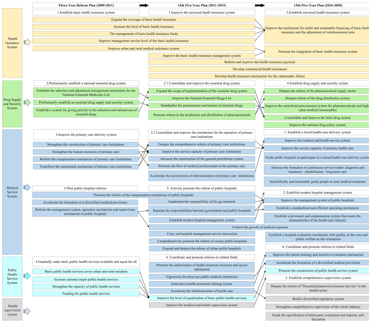
Figure 2 The priorities and relationship among the three healthcare reform plans.