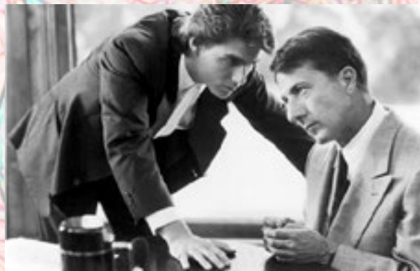
Figure 1. Dustin Hoffman portraying a savant in Rain Man alongside Tom Cruise.