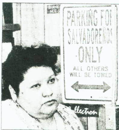
PUEBLO DE MIGRANTES Casi la cuarta parte de los salvadoreños han dejado el país para buscar una vida mejor, adaptándose a otras culturas e idiomas mientras intentan conservar su identidad.

Aquí queremos difundir las condiciones de vida de los salvadoreños en el exterior porque es importante sensibilizar y generar más opinión pública sobre el peso económico, social y cultural que tienen en la vida nacional.