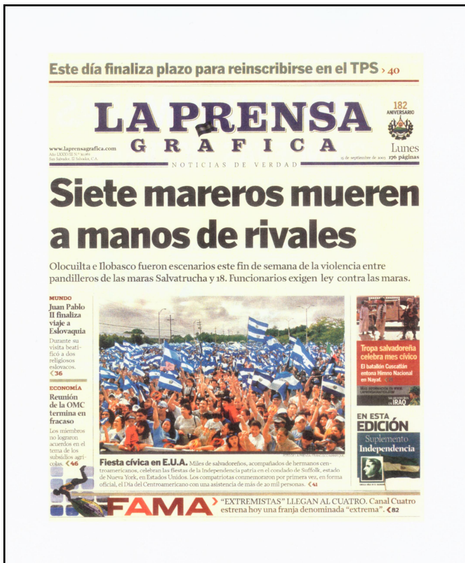
Figure 4. The portrayal of patriotism and gang warfare.

Civic Festivity in the U.S.A. Thousands of Salvadorans, accompanied by Central American brothers, celebrate the festivities of Independence [of the patria ] in Suffolk county, state of New York, in the United States. The compatriots commemorated for the first time, in an official manner, the Day of the Central American with an attendance of over 20,000 people (LPG 15 September 2003). 12