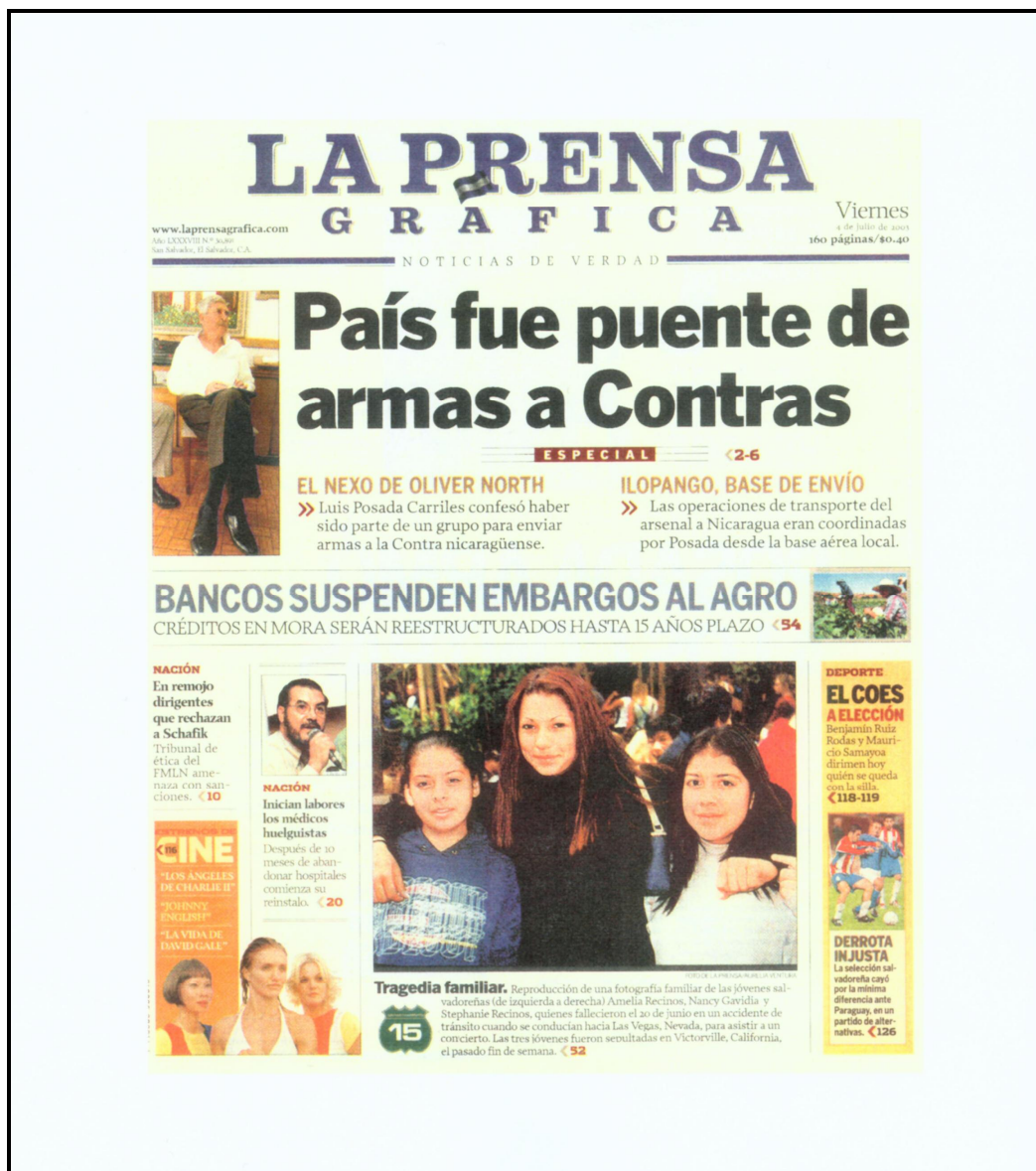
Figure 3. País fue puente de armas a Contras/Tragedia familiar. La Prensa Gráfica , 4 July 2003.

In this specific page we find both items of current, national, updated, post-war news placed on the margins, in small print, in contrast to the news about the Contras and the young Salvadorans in California. News about El Salvador's relationship to the United States is prioritized in this page; yet there a curious absence, considering the date, July 4.