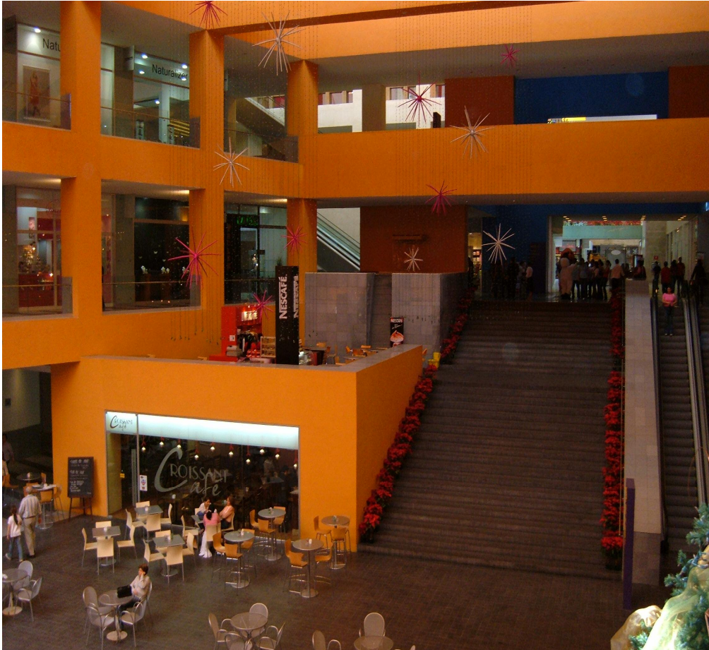
Figure 5. “To eventually stroll into a coffee shop.” Multiplaza, 2005.

elements within a modern capitalist structure fulfills a powerful function: “the picturesque, the primitive, can seduce the tourist because of their contrast to his/her everyday life, but it is even better if the folkloric-advertising discourse can convince him/her that poverty need not be eradicated” (García Canclini 1993: 42). Tradition lends social status; “the local” lends legitimacy and coherence to a trans/national project. The built environment, after all, is a luxury mall, an imaginary of wealth, designed by a world-class architecture firm; not a tacky, kitschy rural home with bright—but peeling—fuchsia walls. In its scale, it seems to serve the function of a monument to post-war, 21 st century economic progress.