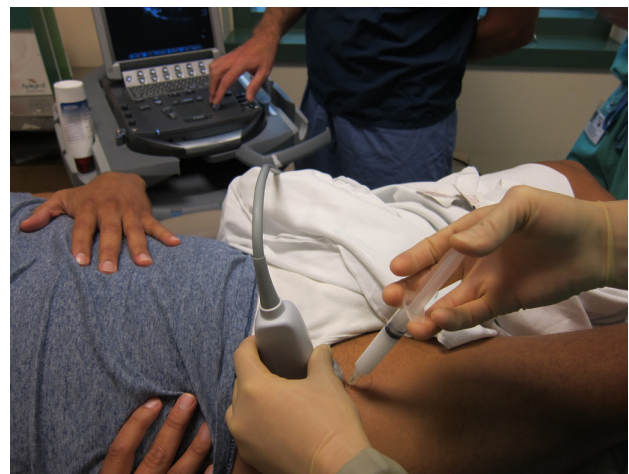
Figure 1. Set-up of ultrasound machine and patient for injection.

An ultrasound system (Sonosite M-Turbo; Bothell, WA) with a low frequency curvilinear probe (2-5MHz) was used to identify the hip joint. Local anesthesia over the injection site was applied using ethyl chloride spray. Using standard sterile procedure and local analgesia, a 10cc syringe filled with a 5cc mix of bupivacaine and 40mg of triamcinolone attached to a 20g 3.5 inch spinal needle was guided into the joint space with real-time in-plane ultrasound guidance (Figure 1) (Video). This solution was then injected after ultrasonographic confirmation that the needle tip was in the joint space (Figure 2). Patients were observed for a period of twenty minutes after the procedure.