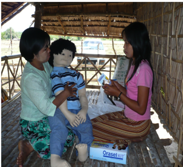
Figure 1. OSP testing of a rural provider. doi:10.1371/journal.pone.0030196.g001

All practitioners were long-standing members of the Sun Quality Health network operated by PSI/Myanmar. Because of their affiliation with the network, all providers had been trained in management of pediatric malaria and were regularly supplied with rapid-diagnostic test kits (RDTs) and four different formulas of Coartem brand artemisinin-based combination therapy (ACT) for treatment of P. falciparum malaria in patients of all ages. All providers were also supplied with both chloroquine and