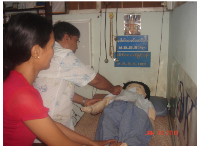
Figure 2. An urban provider examining the OSP mannequin. doi:10.1371/journal.pone.0030196.g002

primaquine-chloroquine combined tablets for the treatment of P. vivax malaria. The RDTs used by the providers identify and distinguish P. vivax and P. falciparum .